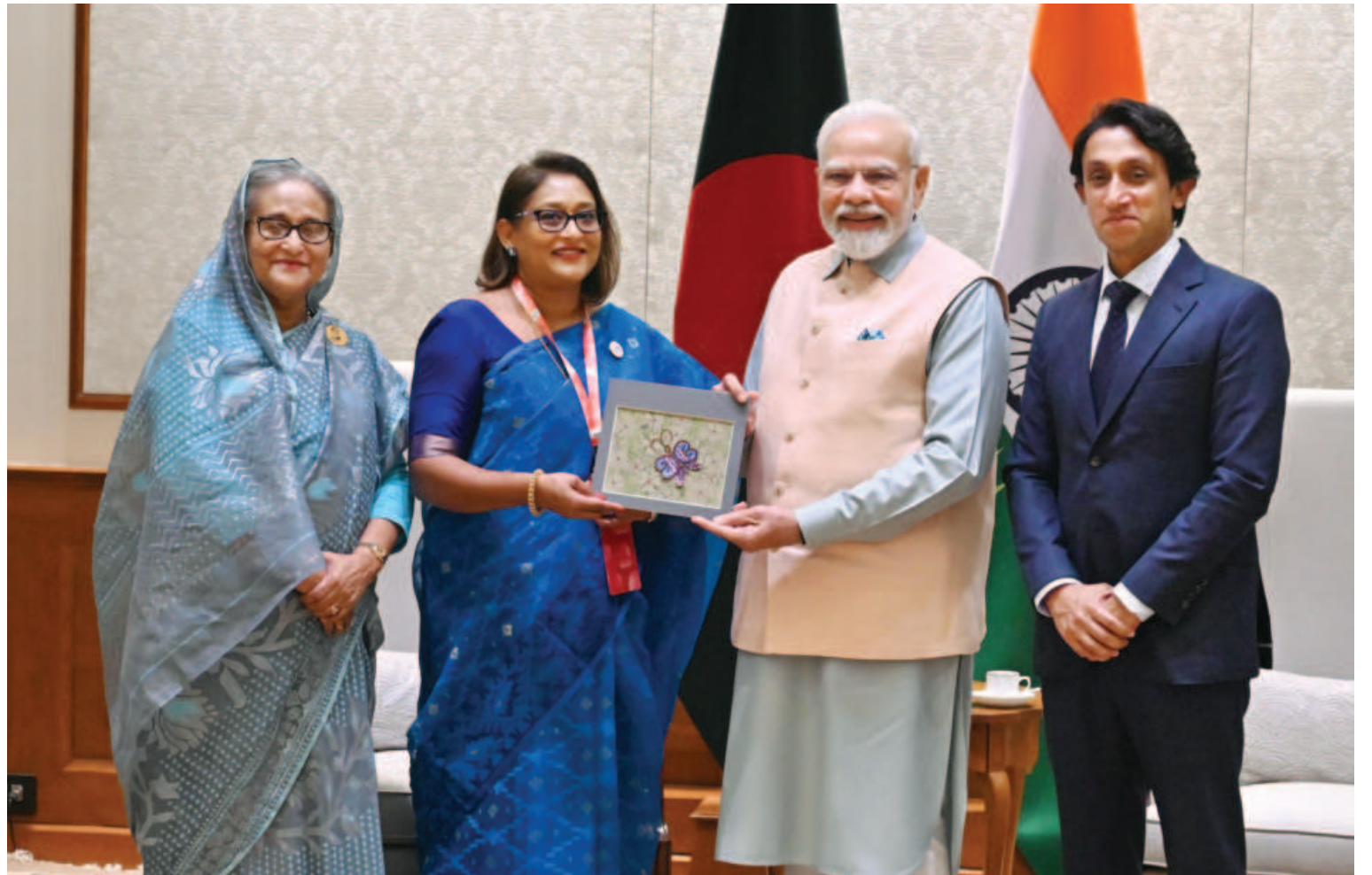
Saima Wazed, a thematic ambassador of the Climate Vulnerable Forum (CVF) and the chairperson of the National Advisory Committee on Autism and Neurodevelopmental Disorders, presents a souvenir to Indian Prime Minister Narendra Modi at the latter's residence in New Delhi, yesterday. Prime Minister Sheikh Hasina and her sister Sheikh Rehana's son Radwan Mujib Siddiq were present there.