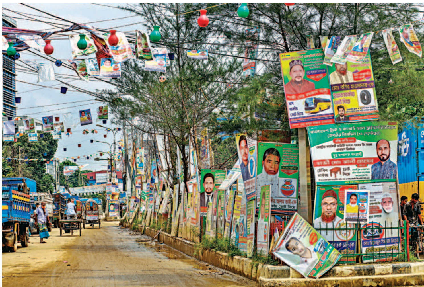
Mayor Annisul Huq Road is flooded with campaign posters and banners in the capital's Tejaon on the eve of the polls to Bangladesh Truck and Covered Van Drivers' Union.