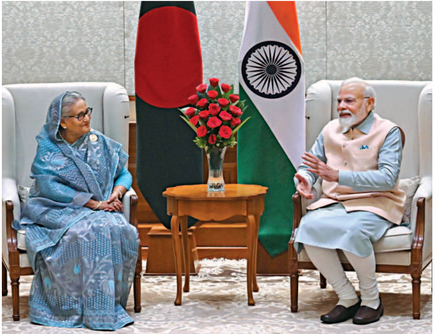
Prime Minister Sheikh Hasina and her Indian counterpart Narendra Modi during a bilateral meeting held at the residence of the latter in New Delhi yesterday.