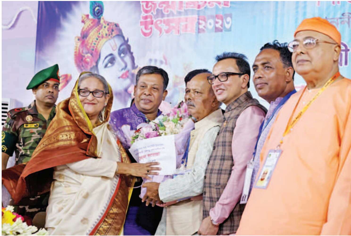
The prime minister exchanging greetings with members of the Hindu community at Gono Bhaban during the holy Janmashtami celebration yesterday.