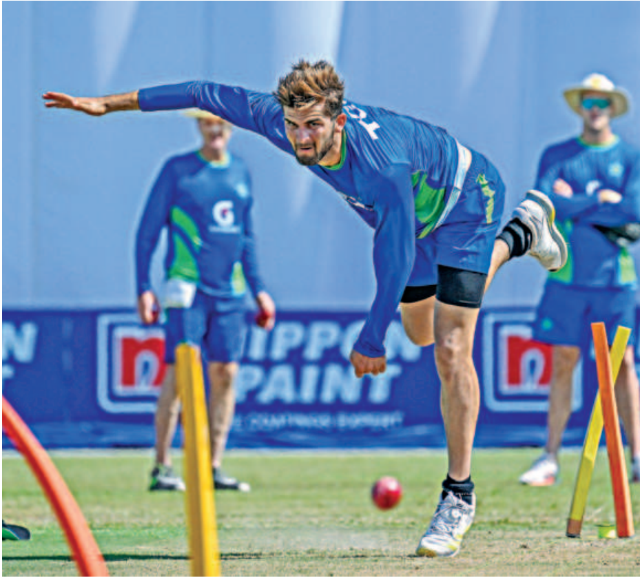
Bangladesh will have their work cut out when they take on Pakistan in a Super Four contest of the ongoing Asia Cup at Lahore's Gaddafi Stadium today. The Tigers received a boost with the inclusion of Liton Das in their ranks after being pegged back as injury ruled out in-form batter Najmul Hossain Shanto from the tournament. For Liton and Co, the threat posed by Pakistan speedster Shaheen Shah Afridi looms large. The left-armers' exploits with the new ball have proved dangerous in the tournament so far, while his death-bowling prowess also remains a serious cause for concern for opponents.