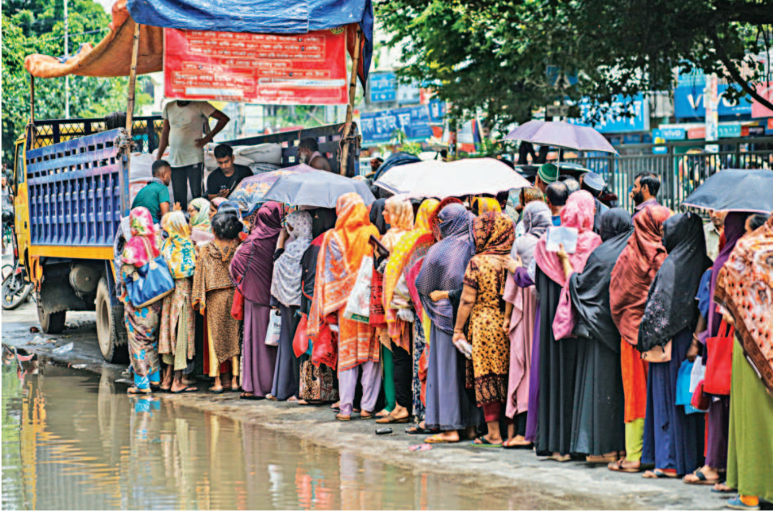
People of the low-income group queued up in front of an OMS truck in Mohammadpur's Ring Road area. Come rain or shine, they wait for hours on end for their turn to get food essentials at subsidised rates in the face of soaring shelf prices.