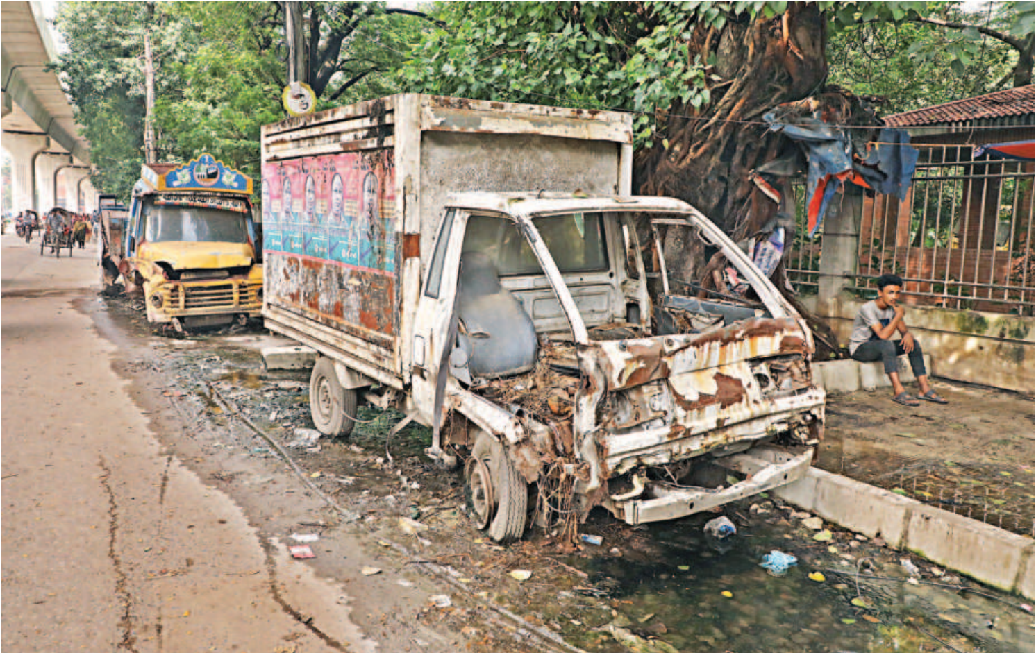
Impounded vehicles are left on the road next to Shahbagh Police Station in the capital, which eventually destroys them. This also causes waterlogging as the drains cannot be cleaned properly. The photo was taken yesterday afternoon.