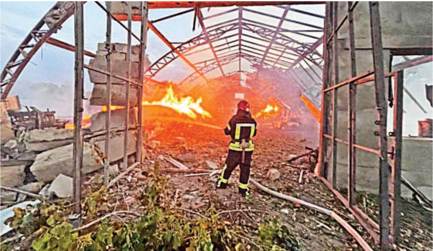
A firefighter works at a site that was hit amid Russian drone attacks, at a location given as Odesa region, Ukraine in this image released yesterday.

About Macron's attending the G20 summit, the embassy said it will allow the president to maintain the constant dialogue with his counterparts from all continents.