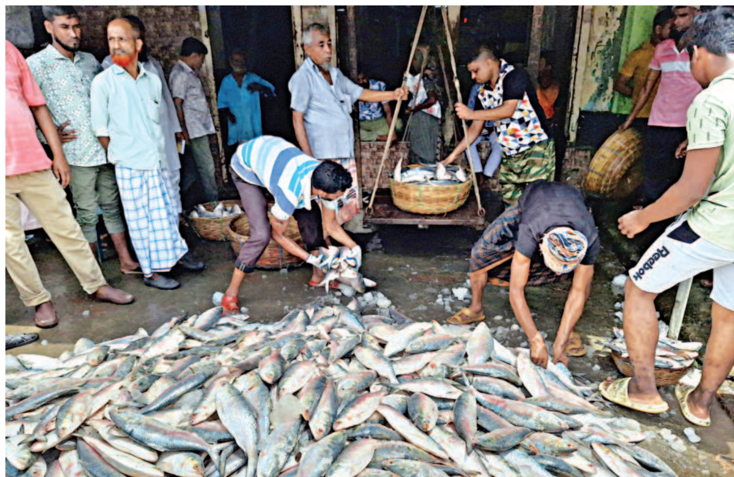
Hilsa production rose slightly to 5.66 lakh tonnes in fiscal 2021-22 from 5.65 lakh tonnes the previous year, according to an estimate by the Department of Fisheries. The picture was taken from a market in Barishal city recently.

The BCC works to prevent, control and eradicate collusion, monopolies, oligopolies, abuse of a dominant position or any other anti-competitive practice in the market.