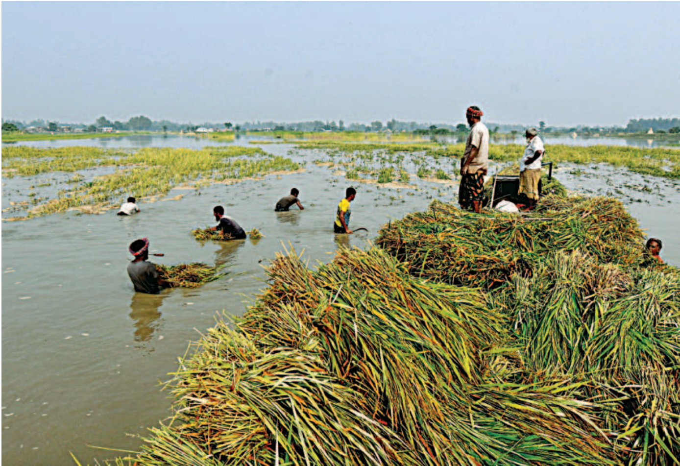
Farmers harvest half-ripe paddy and load them into a boat yesterday, 10 days after the cropland was flooded in Shonpocha Char under Karnibari union in Bogura's Sariaikandi upazila.