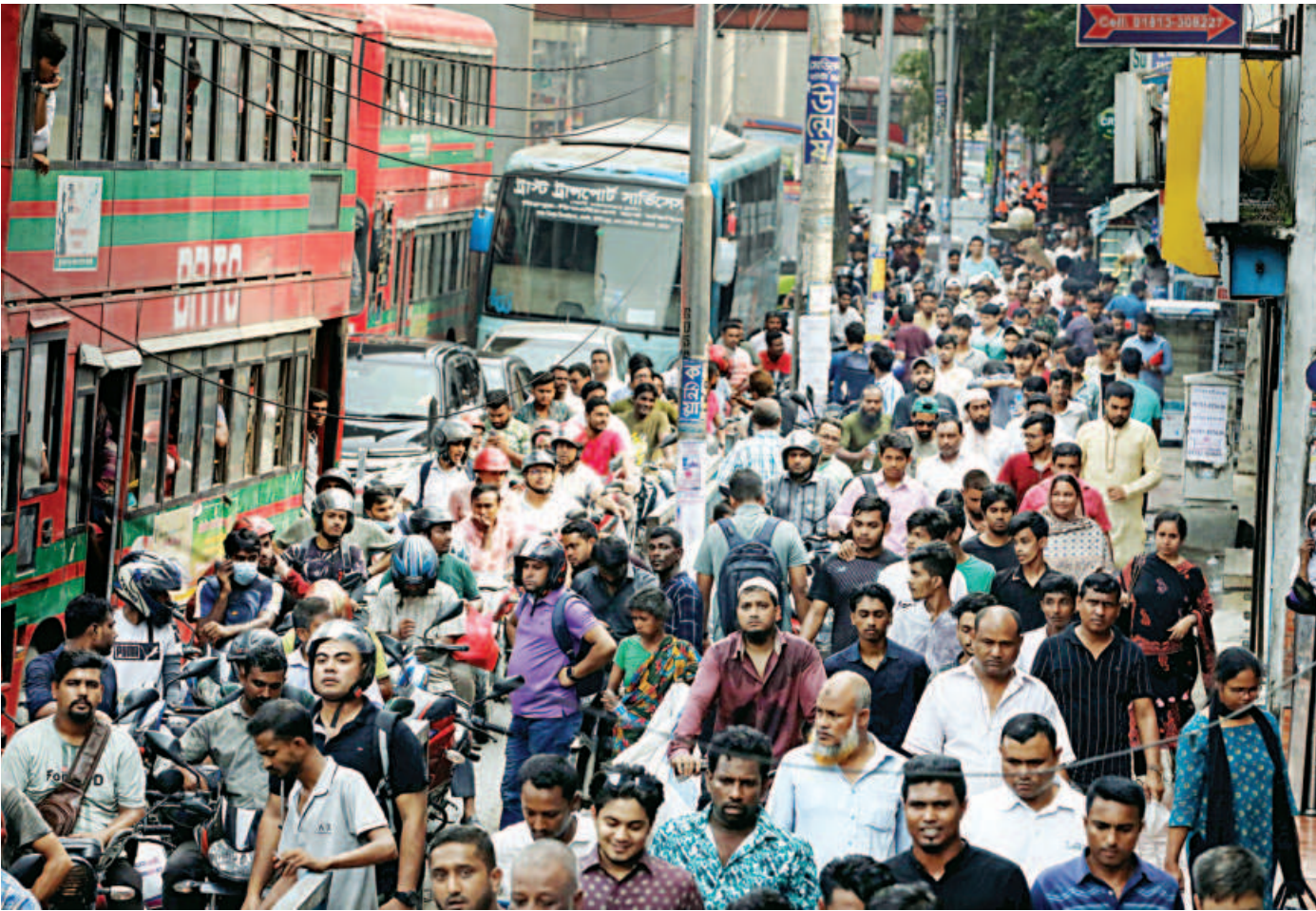
Gridlocks on major city roads yesterday forced many to get off their vehicles midway and walk to their destinations. The photo was taken from Farmgate area in the afternoon.