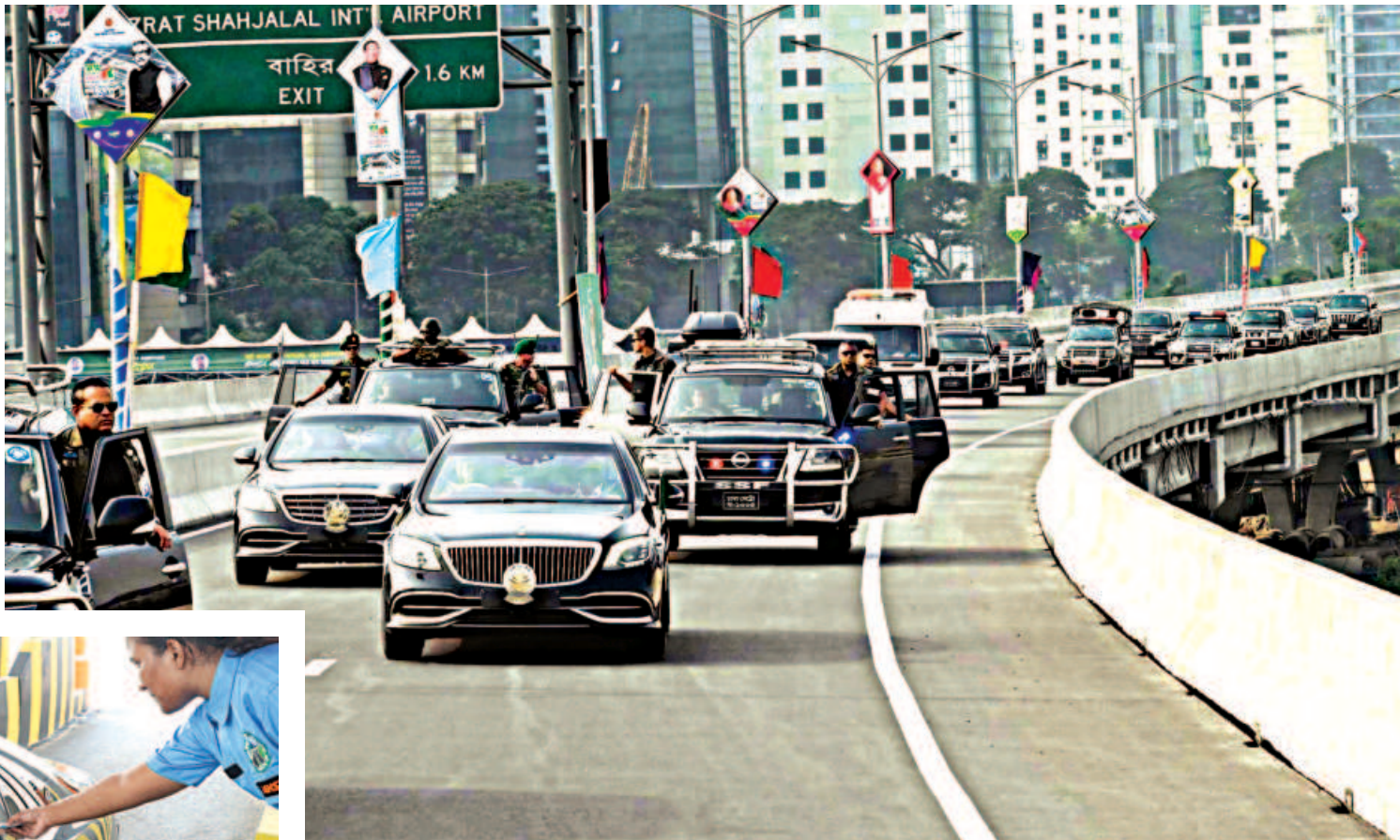
Vehicles of Prime Minister Sheikh Hasina's motorcade on Dhaka Elevated Expressway yesterday. Hasina paid the toll, inset , at the airport end and inaugurated the expressway before travelling towards Farmgate.

CONSTRUCTION MATERIALS INDUSTRY THRIVING ON MEGA PROJECTS; ELEVATED EXPRESSWAY TO SAVE TIME, COST - BI