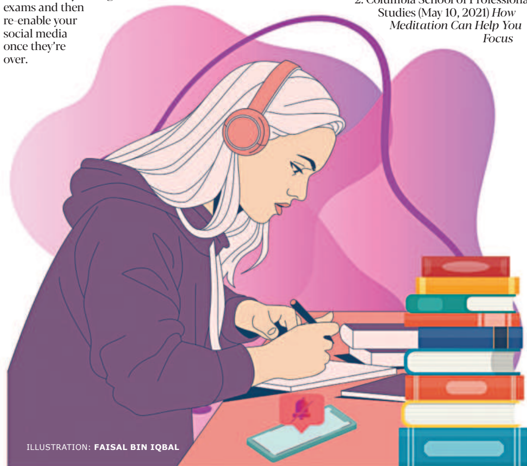
ILLUSTRATION: FAISAL BIN IQBAL