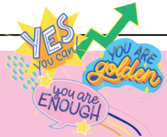
ILLUSTRATION: ABIR HOSSAIN