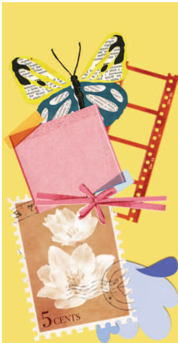
ILLUSTRATION: ABIR HOSSAIN

The writer is a student at St. Joseph Higher Secondary School