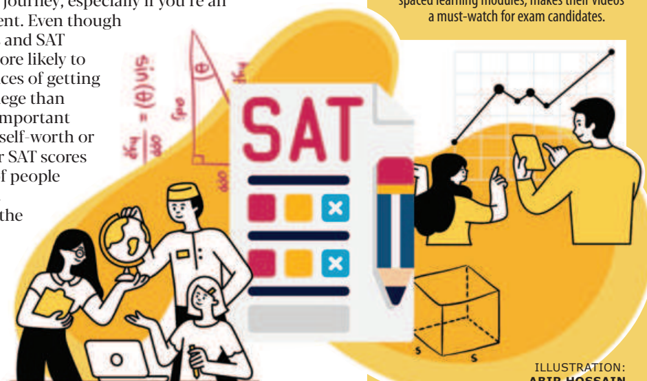
ILLUSTRATION: ABIR HOSSAIN