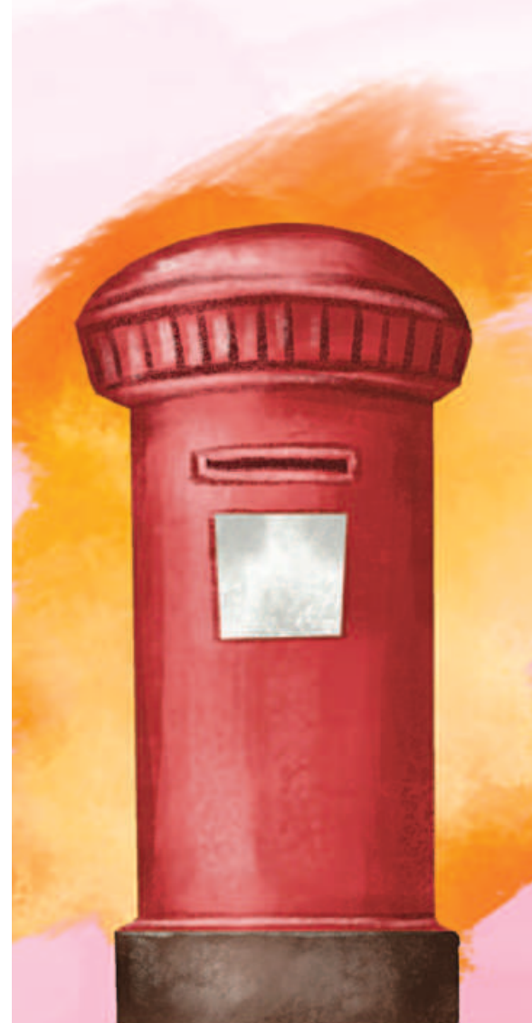
ILLUSTRATION: FAISAL BIN IQBAL