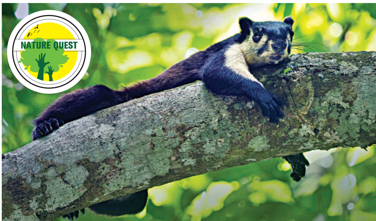
COMPETING FOR CANOPIES ... A black giant squirrel lounging on a tree branch in Moulvibazar's Adampur. Found in many South and Southeast Asian countries, including Bangladesh, this is one of the largest species of squirrels in the world - sometimes weighing up to 1.05-1.25kg, with its head-and-body length going up to 34-37cm and a long tail which can grow till 42cm. The animal, like other squirrels, is solitary and extremely shy. It prefers living in forested areas, where it competes for canopies and food - seeds, pine cones, fruits and leaves -- with other arboreal animals such as primates. It also has a host of predators, mainly birds of prey, but its most dangerous one is humans. In recent decades, the animal's habitat globally has steadily been encroached upon by human settlement, timber harvesting and agriculture, which, along with overhunting, has resulted in its population declining by at least 30 percent over the last 10 years. For this, the IUCN has listed the black giant squirrel in its "Near Threatened" category, urging its immediate conservation.