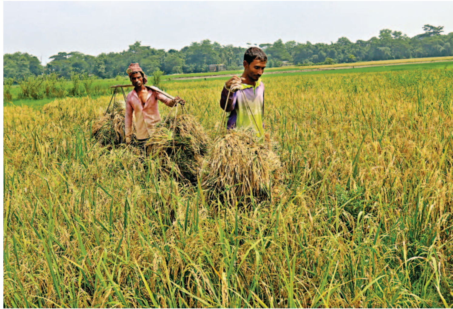
Farmers harvest Aman from a field in Sylhet's Sonatola area. They are happy with the good yield this season thanks to favourable weather. The photo was taken on Wednesday.