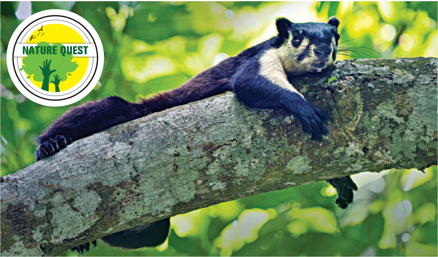
COMPETING FOR CANOPIES ... A black giant squirrel lounging on a tree branch in Moulvibazar’s Adampur. Found in many South and Southeast Asian countries, including Bangladesh, this is one of the largest species of squirrels in the world – sometimes weighing up to 1.05-1.25kg, with its head-and-body length going up to 34-37cm and a long tail which can grow till 42cm. The animal, like other squirrels, is solitary and extremely shy. It prefers living in forested areas, where it competes for canopies and food – seeds, pine cones, fruits and leaves -- with other arboreal animals such as primates. It also has a host of predators, mainly birds of prey, but its most dangerous one is humans. In recent decades, the animal’s habitat globally has steadily been encroached upon by human settlement, timber harvesting and agriculture, which, along with overhunting, has resulted in its population declining by at least 30 percent over the last 10 years. For this, the IUCN has listed the black giant squirrel in its “Near Threatened” category, urging its immediate conservation.