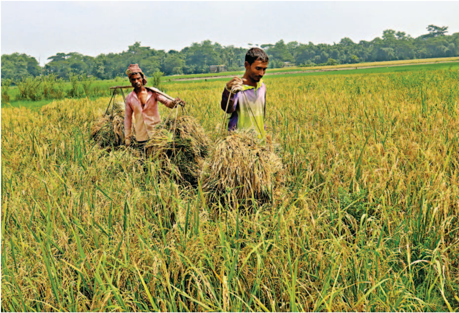
Farmers harvest Aman from a field in Sylhet's Sonatola area. They are happy with the good yield this season thanks to favourable weather. The photo was taken on Wednesday.