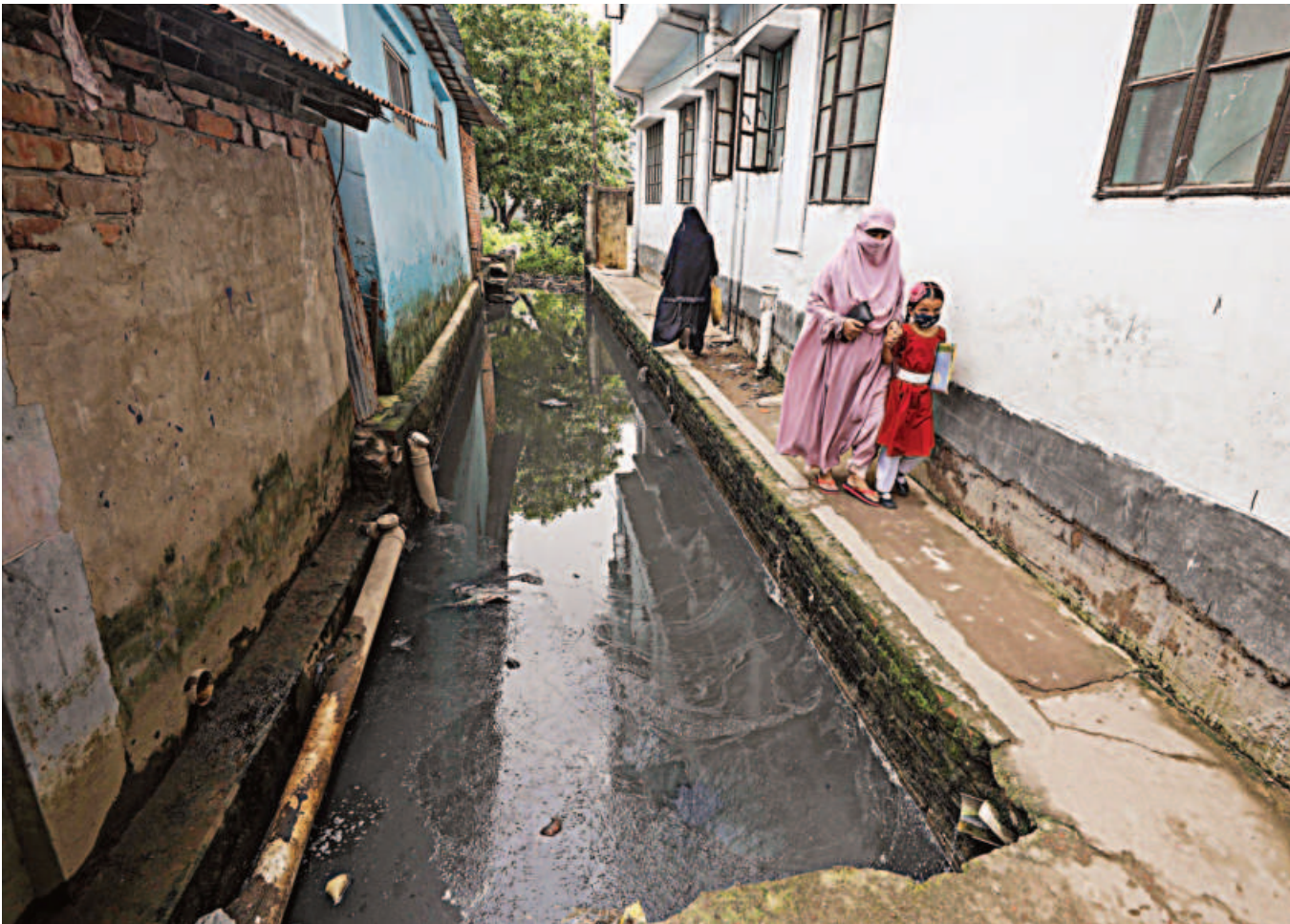
These women and the child are having to be especially careful while leaving their homes in Rangipara area of Chattogram's South Agrabad yesterday as the drains there are not only open but also without any safety fences. Just three days ago, an 18-month-old child's body was found in a drain after he went missing in the area. Such incidents are all too frequent in the port city with the authorities concerned seemingly ignoring the fatalities and injuries caused by unprotected drains and canals.