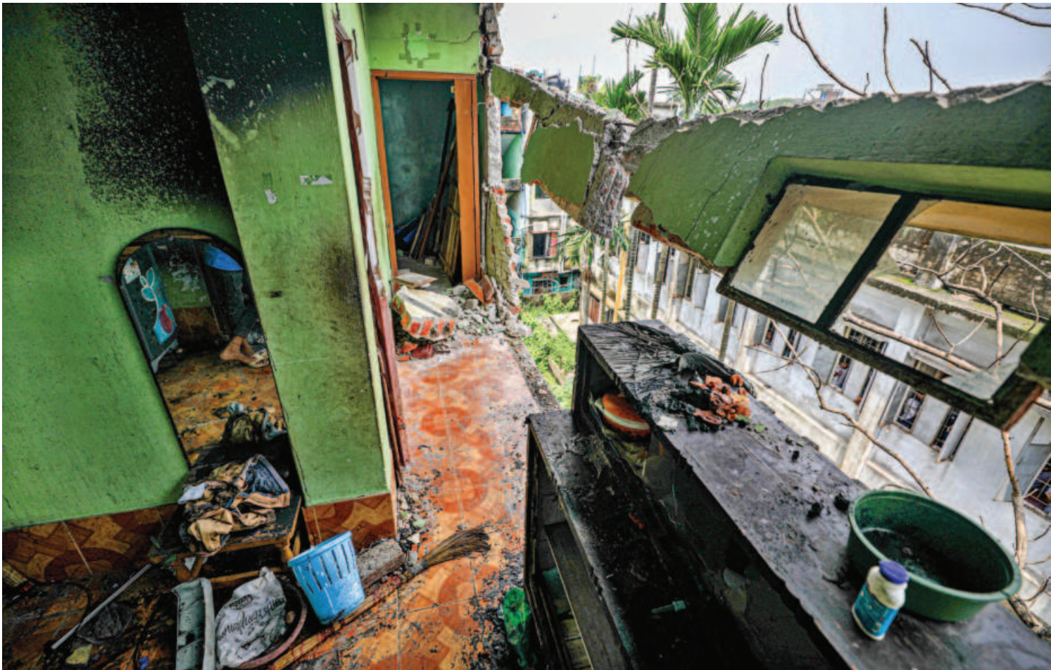
Part of this house has been blown up in an explosion caused by gas leak in Chattogram city’s South Halishahar yesterday. The blast left one dead and another injured. Story on page 5.