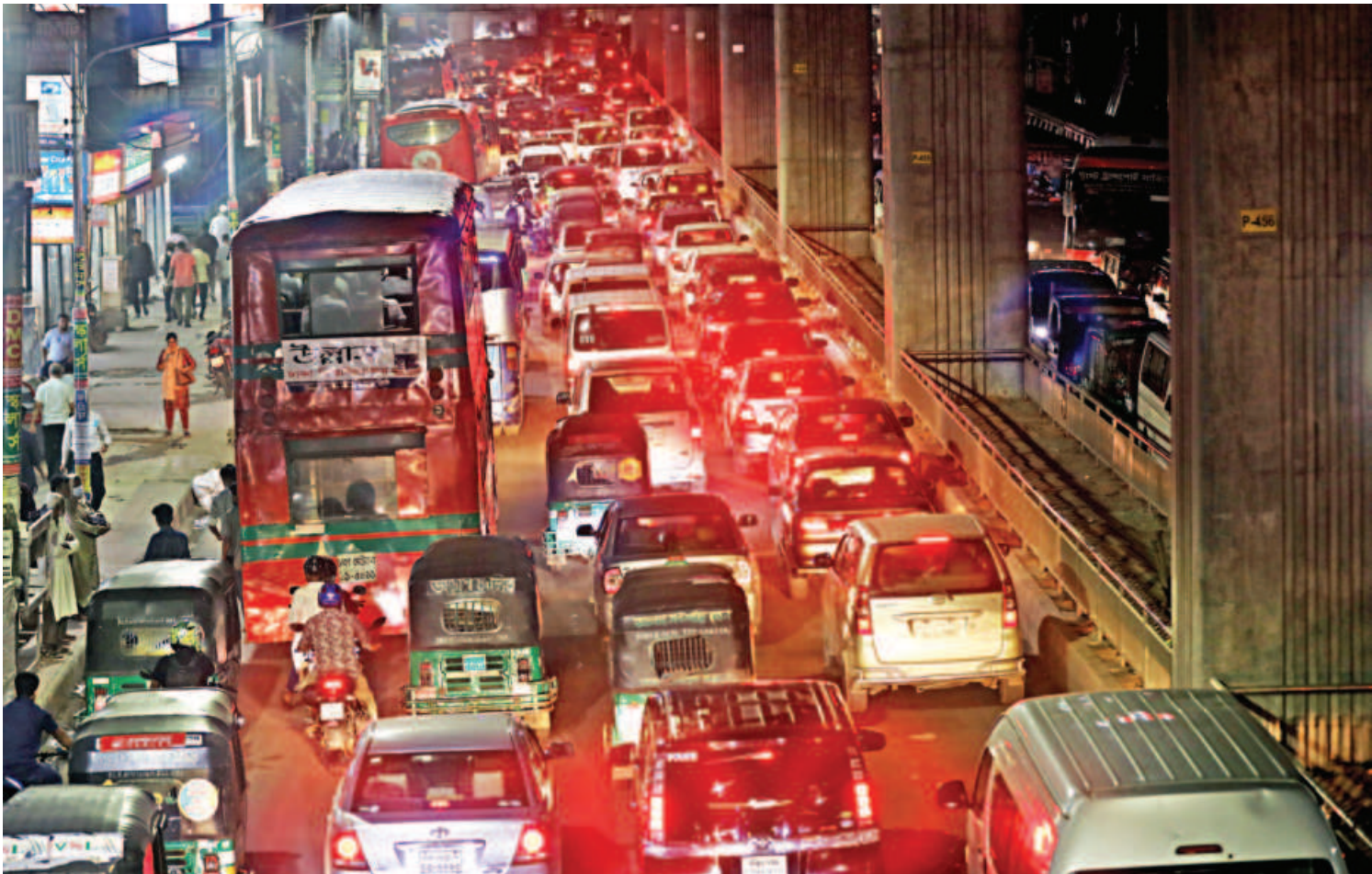
Following regular office hours, a long tailback on Kazi Nazrul Islam Avenue in the capital exacerbated commuters’ sufferings. The narrowing of the road near the Farmgate police box further added to the traffic menace. The photo was taken yesterday.