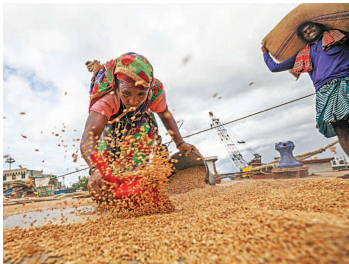
Overall wheat consumption in Bangladesh may reach 68 lakh tonnes in the marketing year of 2023-24, the US Department of Agriculture said.

The agency revised upward its forecasts regarding wheat production in Bangladesh to 11 lakh tonnes, anticipating that farmers would retain their acreage in marketing year 2023-24 for receiving good prices in the previous year.