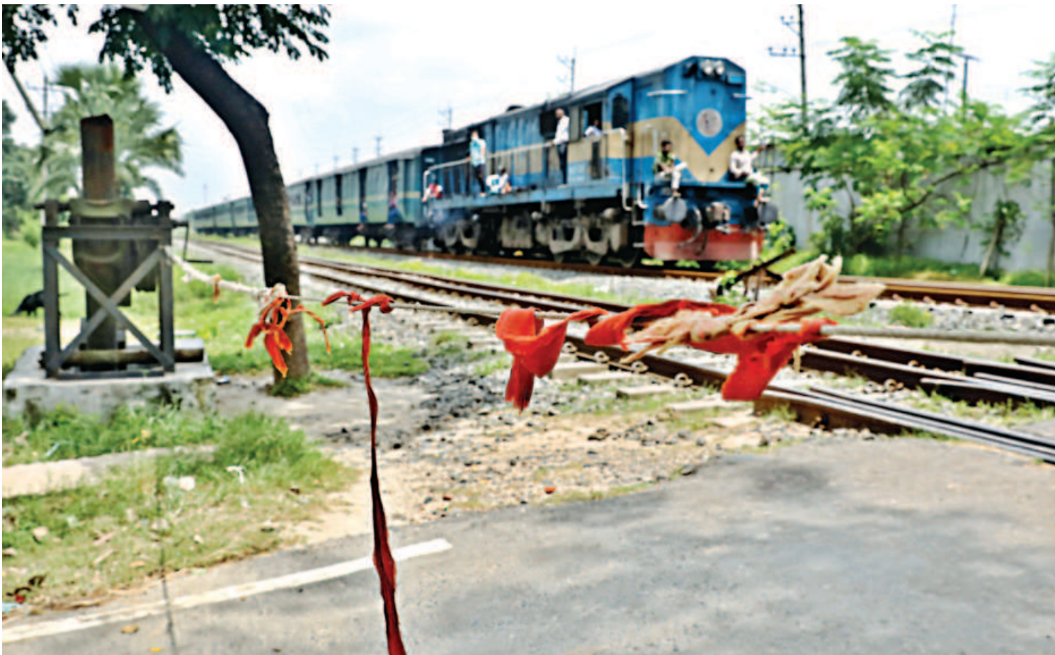
Since there is no gate to block traffic when trains approach, the gatekeeper ties a rope at the level-crossing in Hyderabad area of Gazipur. Strips of red cloth are attached to the rope to increase visibility. A proper barrier is needed to make the level-crossing on the busy street safer.

The remains of the ancient building were revealed in the Viru Valley, some 480 km (298 miles) north of Lima.