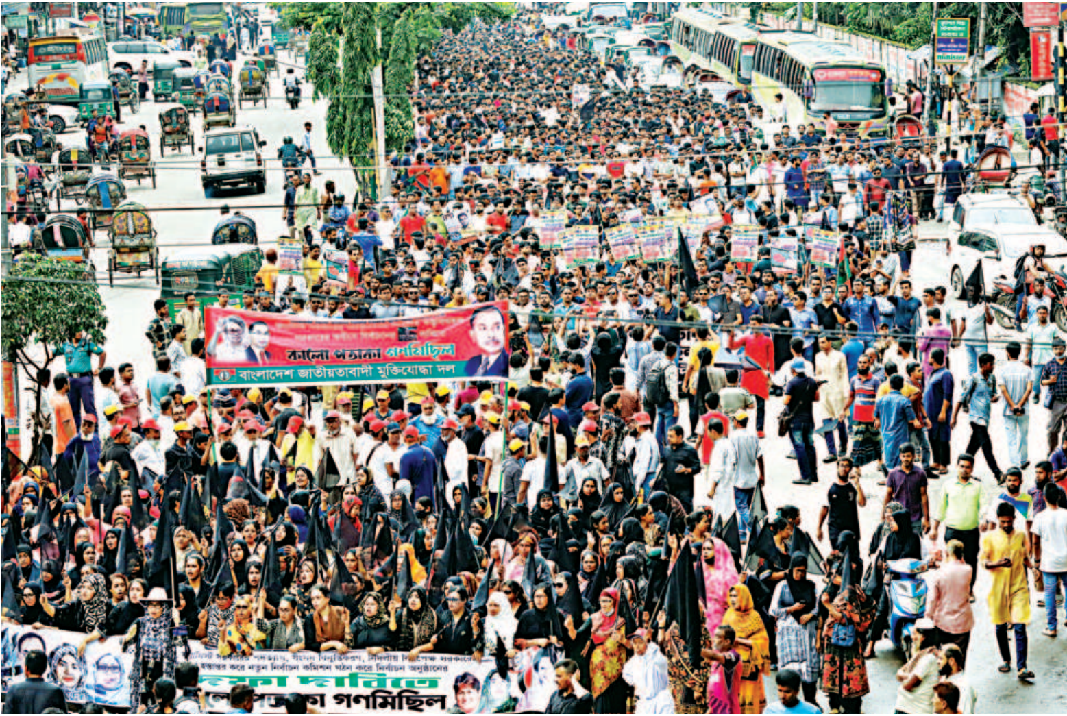
BNP leaders and activists in a procession waving black flags in the capital's Arambagh yesterday as part of the party's one-point movement demanding the resignation of the government and general election under a non-party neutral government.