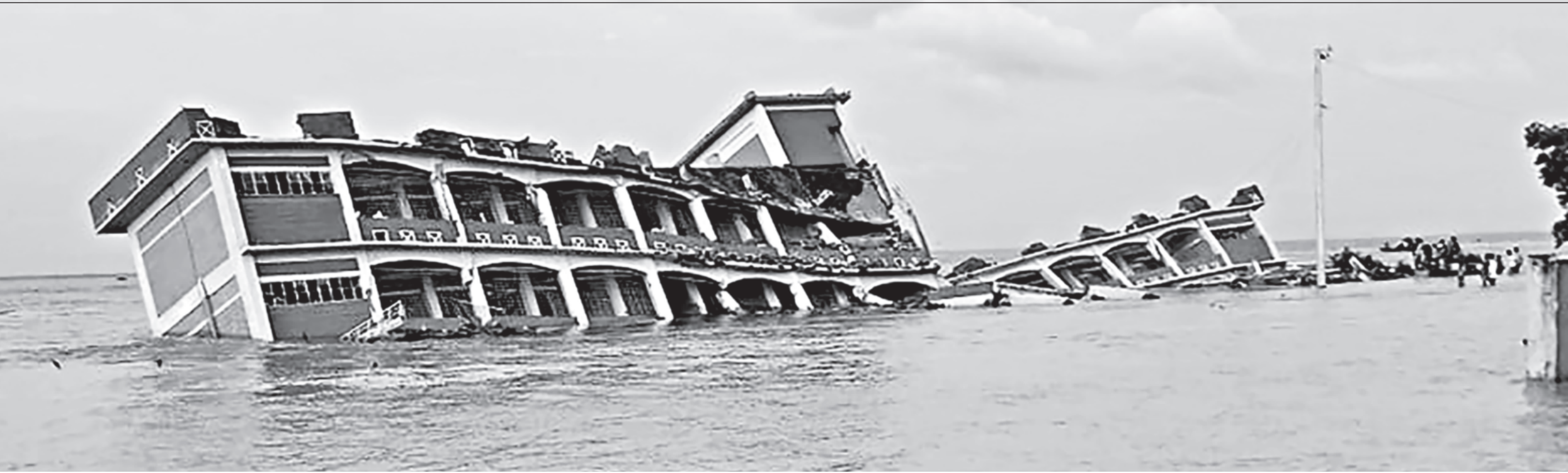
This newly constructed school building in Madaripur’s Shibchar upazila was able to withstand the force of the Padma’s current for two weeks before it collapsed into the river, thanks to the erosion.