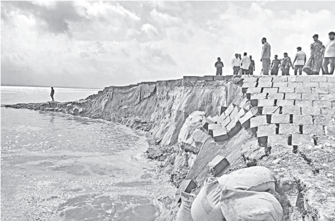
The solid spur embankment at the Meghai point of Jamuna River in Sirjaganj’s Kazipur upazila gave away in face of the river’s strong current as the river swelled with monsoon rains in July this year.

To mitigate the erosion problem, Bangladesh needs to shun the Cordon approach and return to the Open approach that is suitable for the country’s special physical conditions. This also requires resuscitation of the smaller rivers, rivulets, canals, etc, that used to keep the major rivers connected with the floodplains. In addition to canals, Bangladesh also needs to revive the old practice of Ashtomashi bandh, i.e. temporary dams lasting for eight months of the year. These dams allowed river overflows to be preserved in the floodplains and flow back to the river during the dry season to stabilise the flow across the seasons.