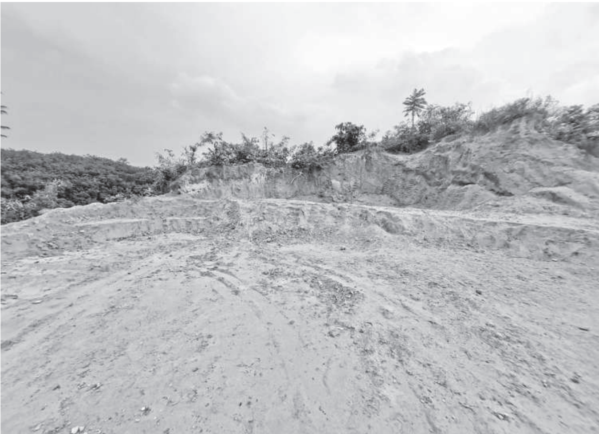
Illegal hill cutting in Jaychandi union of Moulvibazar has left the area desolate. A syndicate operating in the area is razing the hill to sell soil and stones. As a consequence of their activities, the risk of landslides has mounted. The photo was taken recently.