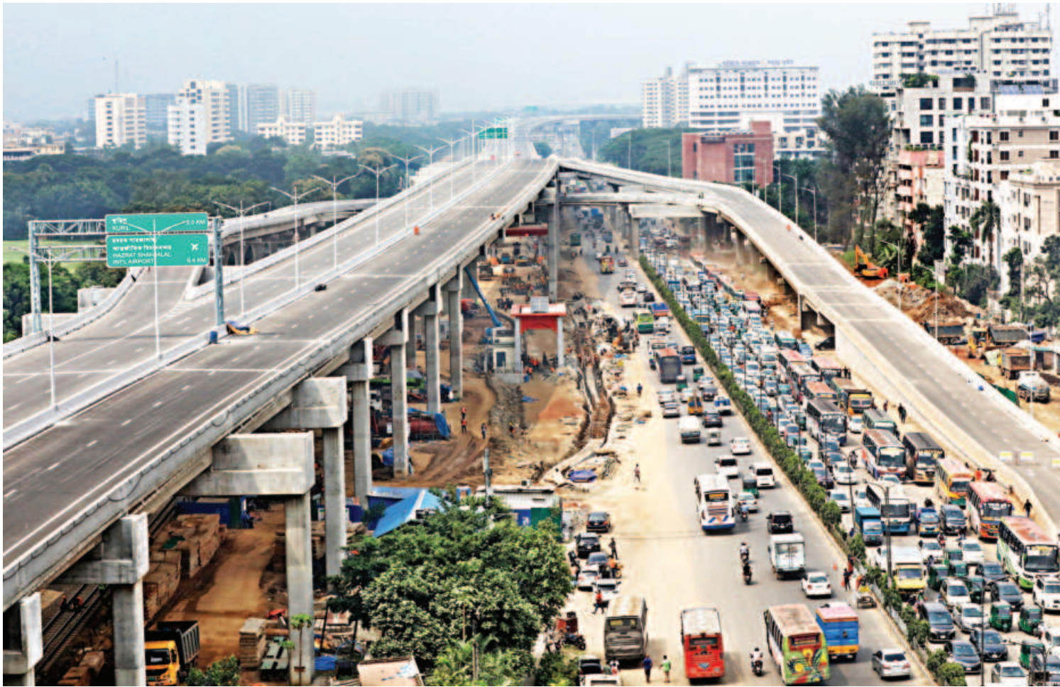
A long tailback on the southbound lane of Airport Road near Kakoli intersection in the capital yesterday. Many hope that once the Dhaka elevated expressway, on the left, is inaugurated on September 2, congestion will significantly reduce in the area.