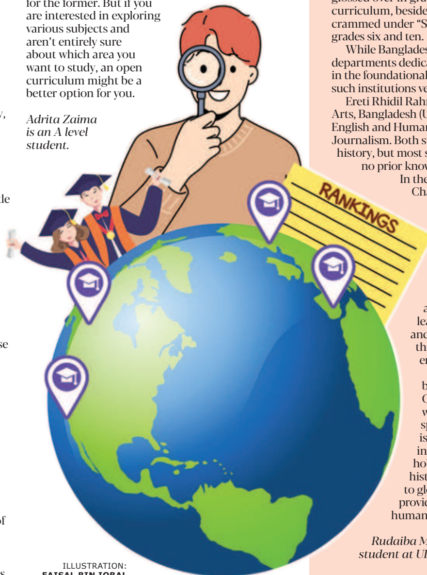
ILLUSTRATION: FAISAL BIN IQBAL