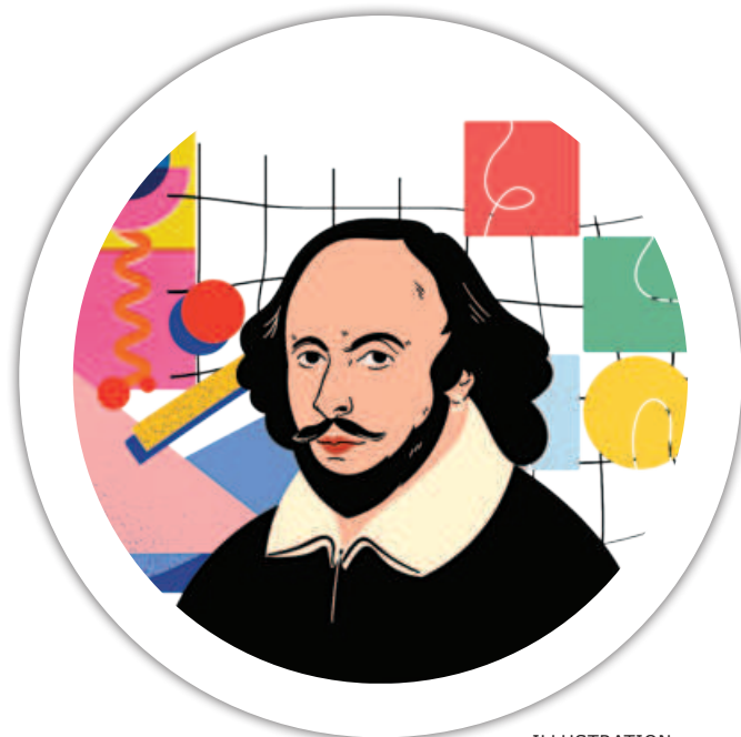
ILLUSTRATION: ABIR HOSSAIN

While magazine writing may be very similar to freelance content writing, the latter is more focused on elements like SEO and keywords. Writing for a magazine, however, is vastly different.