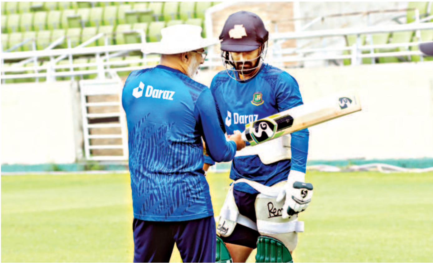
Liton Das was seen taking instructions from Bangladesh head coach Chandika Hathurusingha at the Sher-e-Bangla National Cricket Stadium in Mirpur yesterday as the Tigers' ODI vice-captain went straight back to business following his stint in the Lanka Premier League, where he played alongside Shakib Al Hasan for the Galle Titans. [Below] Shakib experienced a different kind of busy afternoon as commercial engagement saw the Bangladesh captain fly to Barishal in a helicopter to inaugurate the Alhaj Nur Mohammad Munshi Hospital.