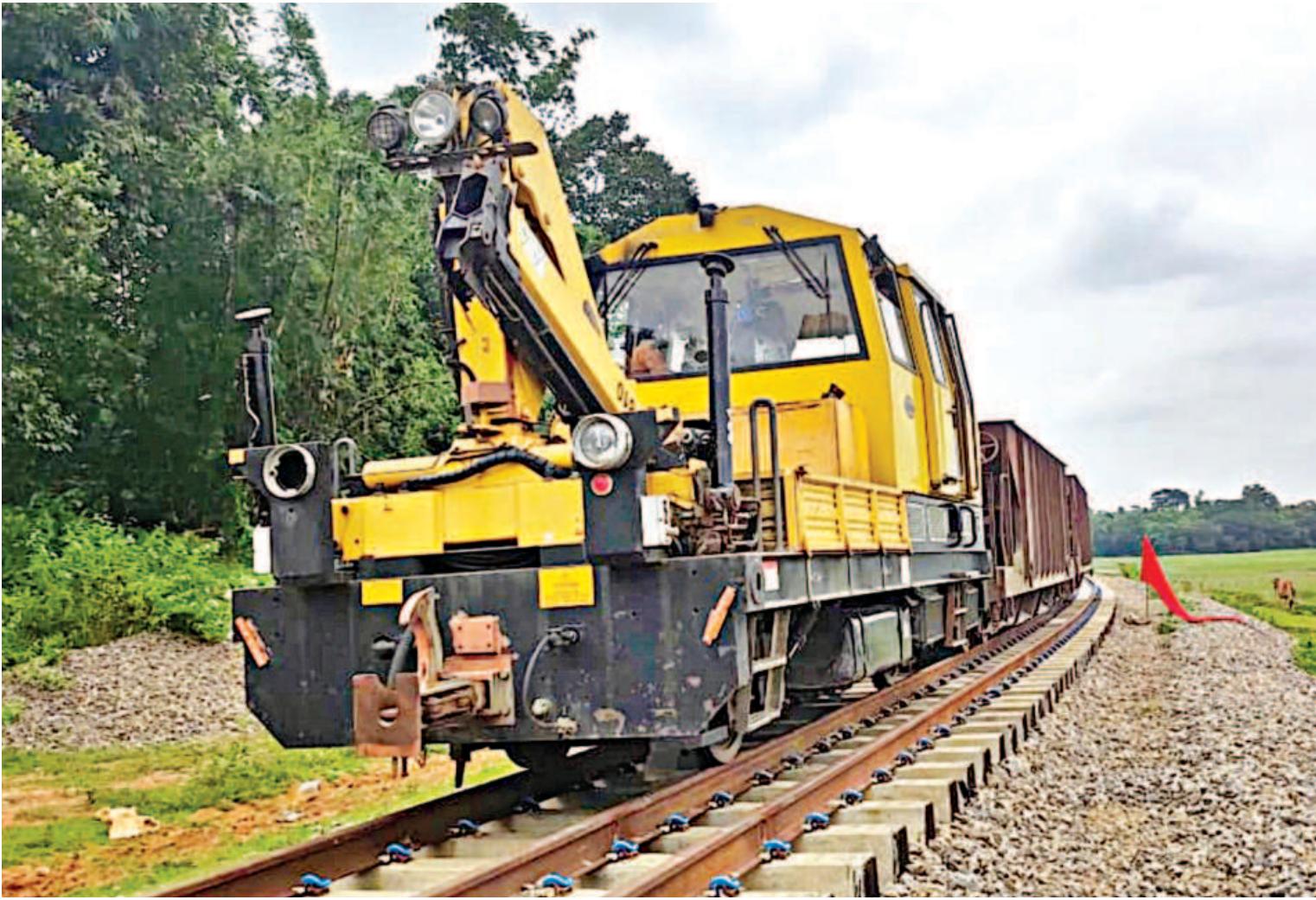
Railway officials use a special car to inspect the Akhaura-Agartala line which will be opened soon. Project officials hope that they would be able to run tests with locomotives this month.