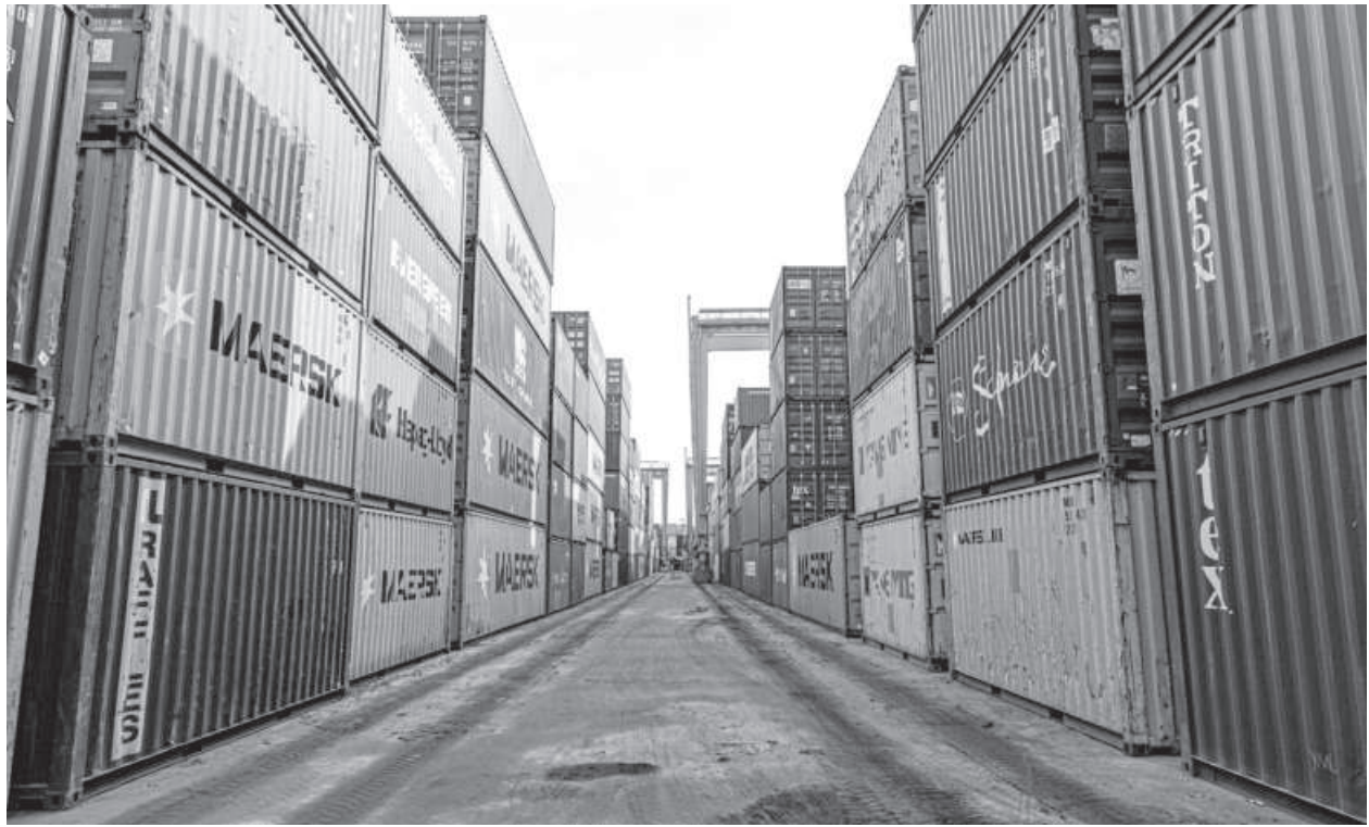
The new tariff policy will play an important role in export diversification.

At present, local companies are protected by high import tariffs. Various types of tariffs are imposed on imports such as customs duty, regulatory duty, supplementary duty, value added tax, advanced tax, and advanced income tax. The average tariff protection rate was around 30 percent in FY 2022-23. The reasons behind such a high tariff are: 1) to generate revenue through higher import duty since tax as a percentage of GDP is low at only 8.5 percent in FY 2021-22; and 2) to protect local industries from international competition. The government earns a large amount of revenue from import duties on raw materials, intermediate goods, and consumer goods. But following tariff