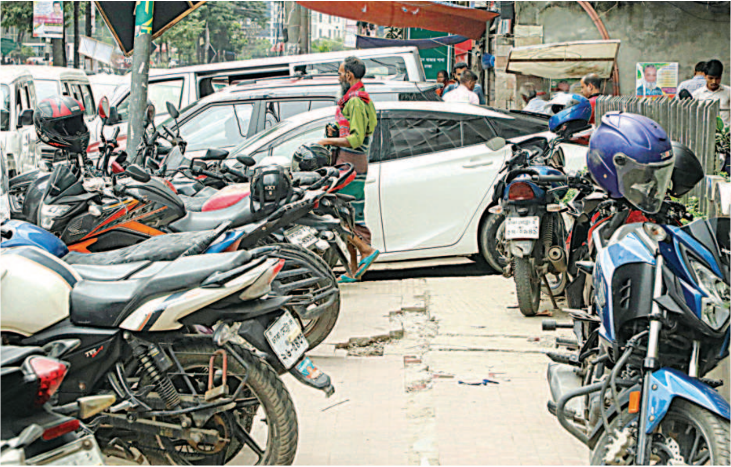
Parked motorbikes and cars completely block the pavement for pedestrians at Karwan Bazar. The photo was taken across the street from Hotel Sonargaon yesterday.