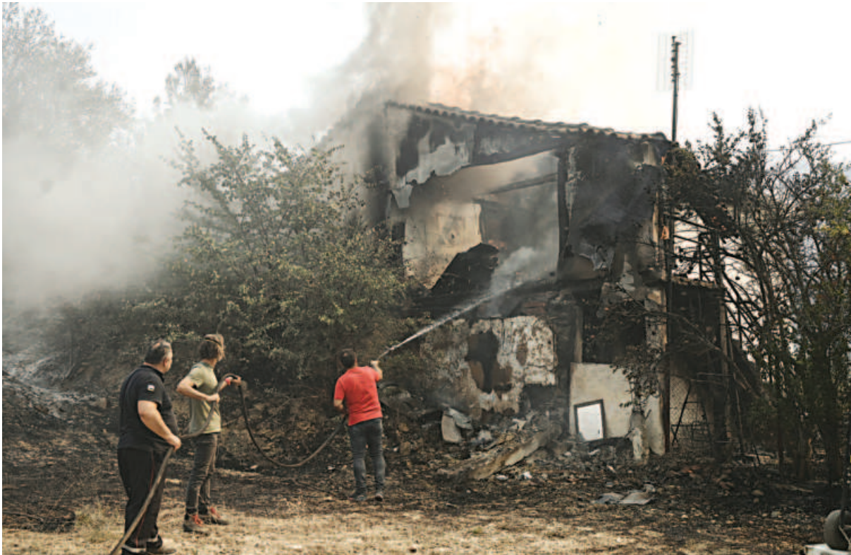
Local residents extinguish a fire in Avanta, near Alexandroupoli, northern Greece yesterday. Eighteen burned bodies, possibly of migrants, were found in the remote, rural area south of the village of Avantas in northern Greece yesterday where wildfires have been burning for days, the fire brigade said.

The leader of Russia’s Wagner mercenary group Yevgeny Prigozhin said in a video published Monday that his group was making Africa “freer” and suggested he was on the continent. Prigozhin, a former Kremlin ally whose group rebelled against Russia’s military leadership in June, has made few public appearances since the mutiny. The group maintains a strong military presence in Africa, where it has partnered with several nations, including Mali and the Central African Republic. “We are working. The temperature is above 50 degrees Celsius (122 degrees Fahrenheit). Just how we like it,” Prigozhin said in the video, which AFP was unable to immediately verify. The video shows Prigozhin holding an assault rifle, before panning around to reveal military vehicles parked on a large, desert-like plain. “The Wagner Group is conducting reconnaissance and search activities. Making Russia even greater on every continent -- and Africa even freer,” Prigozhin said.