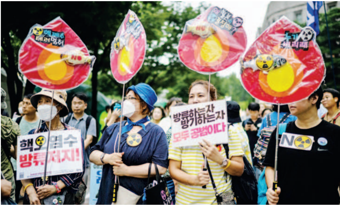
Activists hold placards that translate as “Nuclear contaminated water - Stop the discharge” and “The discharger and the one who allows it to happen - Both accomplices” during a protest against the planned release of wastewater from Japan’s stricken Fukushima nuclear plant into the Pacific, outside the City Hall in Seoul, South Korea yesterday, after Japanese Prime Minister Fumio Kishida announced the release will begin tomorrow.

Ethiopia will launch a joint investigation with Saudi Arabia into a Human Rights Watch report accusing the kingdom’s border guards of killing hundreds of Ethiopian migrants, the foreign ministry said yesterday. “The Government of Ethiopia will promptly investigate the incident in tandem with the Saudi Authorities,” the ministry said on X, formerly Twitter, a day after the publication of the HRW report sparked global outrage. “At this critical juncture, it is highly advised to exercise utmost restraint from making unnecessary speculations until (the) investigation is complete,” the ministry said, noting the “excellent longstanding relations” between Addis Ababa and Riyadh. The allegations, described as “unfounded” by a Saudi government source, point to a surge in abuses along the perilous route from the Horn of Africa to Saudi Arabia, where hundreds of thousands of Ethiopians live and work. One 20-year-old woman from Ethiopia’s Oromia region, interviewed by HRW, said Saudi border guards opened fire on a group of migrants they had just released from custody.