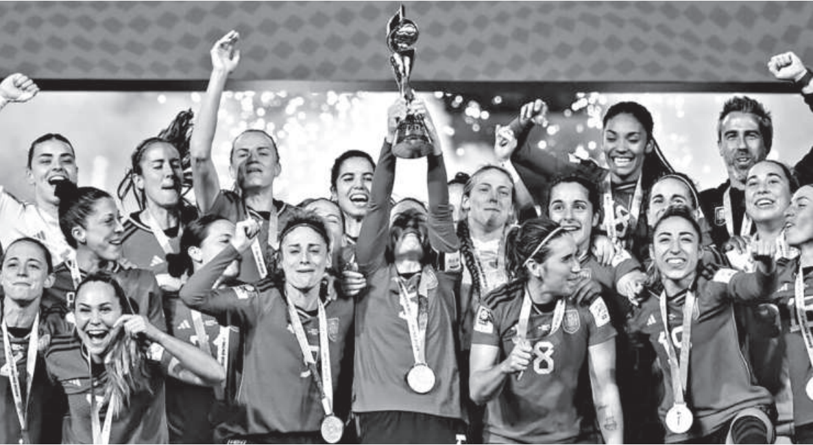
If actions indeed speak louder than words, the footballers who played in the just-concluded Women’s World Cup have unequivocally demonstrated their worthiness of the support they seek and require.