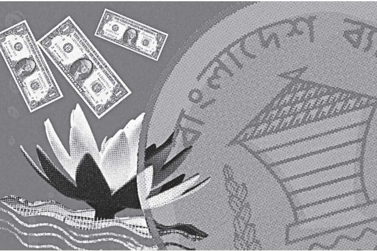
COLLAGE: REHNUMA PROSHOON