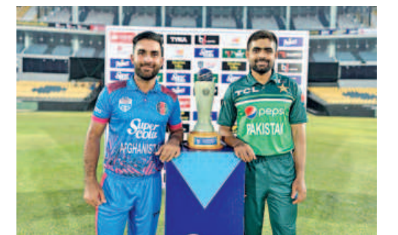
Pakistan captain Babar Azam and his Afghanistan counterpart Hashmatullah Shahidi pose with the trophy in Hambantota yesterday ahead of their three-match ODI series which starts today. The first bilateral ODI series between the two teams, which is being held in Sri Lanka, will be followed by the six-nation Asia Cup beginning on August 30.

Chief selector Ajit Agarkar said it was a "no-brainer" that the 17-member squad pretty much included the 15 who would play the World Cup.