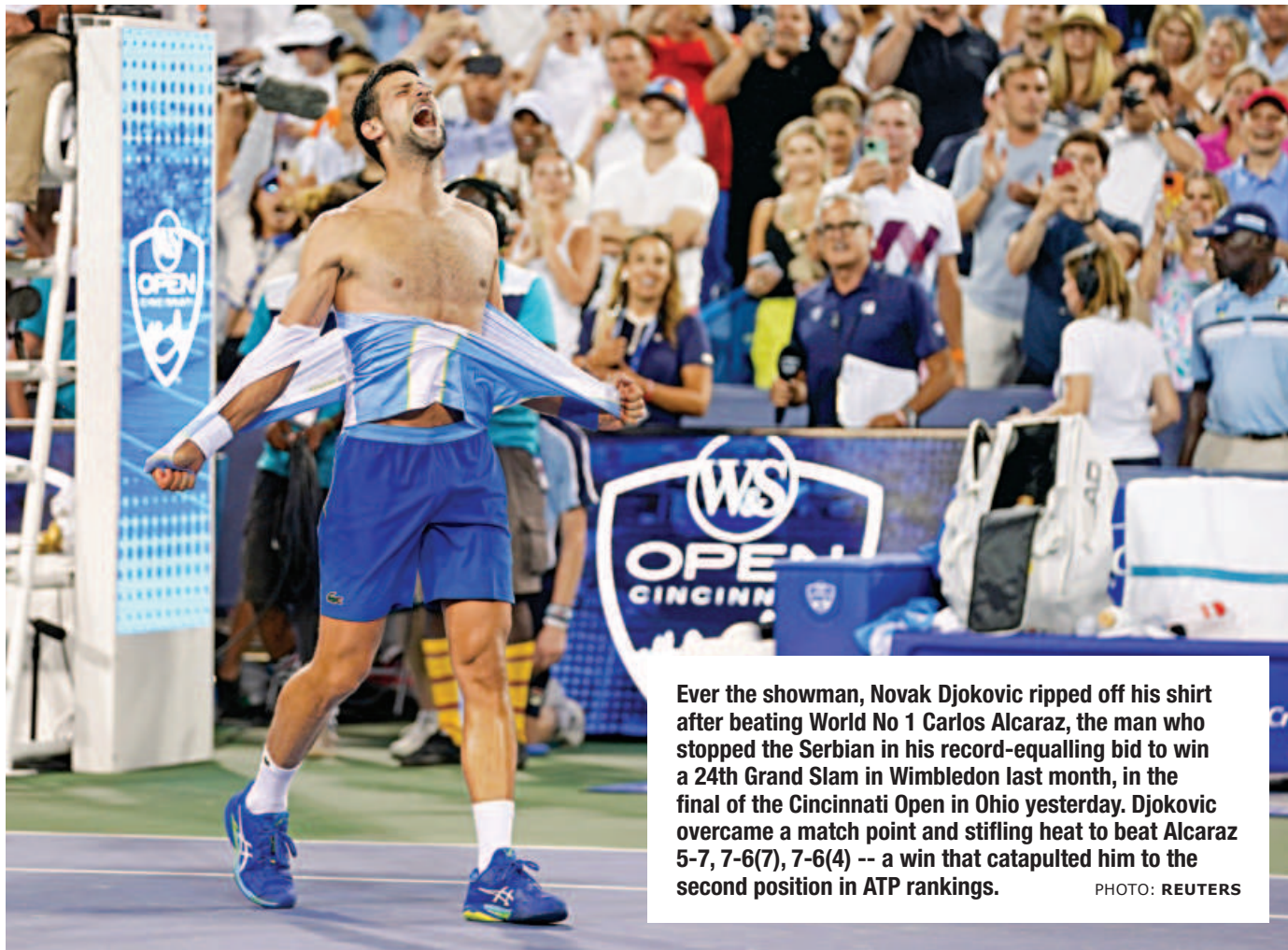
Ever the showman, Novak Djokovic ripped off his shirt after beating World No 1 Carlos Alcaraz, the man who stopped the Serbian in his record-equalling bid to win a 24th Grand Slam in Wimbledon last month, in the final of the Cincinnati Open in Ohio yesterday. Djokovic overcame a match point and stifling heat to beat Alcaraz 5-7, 7-6(7), 7-6(4) -- a win that catapulted him to the second position in ATP rankings.