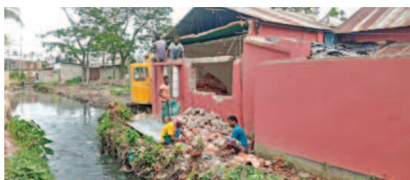
An excavator dismantles an illegal structure along the Mashkanda Canal in Mymensingh city. The photo was taken recently.