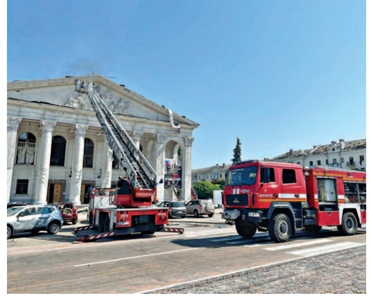
Rescuers work on the site hit by a Russian missile strike, amid Russia's attack on Ukraine, in Chernihiv, Ukraine yesterday

[Our correspondents in Patuakhali, Narayanganj, Manikganj also clash. Three of them were contributed to this report.]