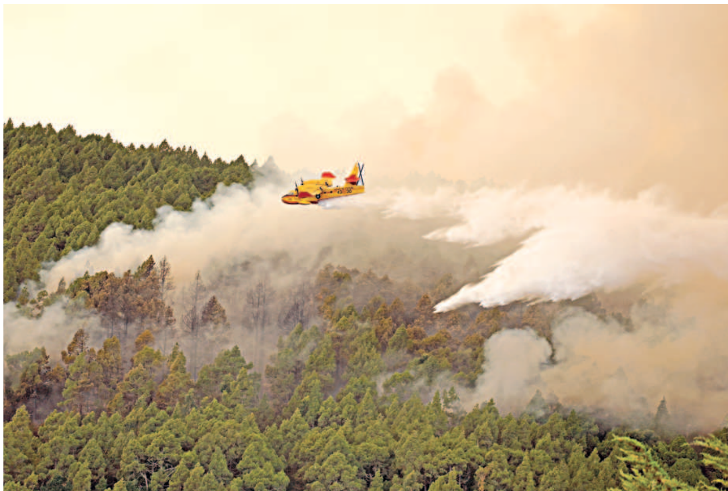
A firefighter plane discharges water over a forest fire in La Esperanza on the island of Tenerife, Canary Islands, Spain yesterday. The blaze has destroyed more than 2,600 hectares, affecting some 7,600 people, many of whom were evacuated.

Police had arrested over 100 suspected rioters, the government statement said, adding that an inquiry has been ordered into the incident.