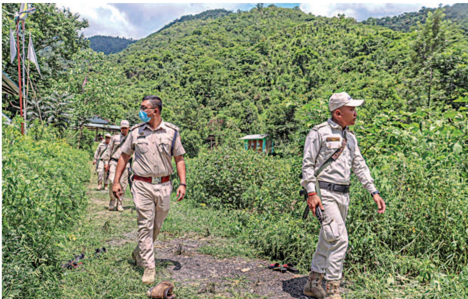
Manipur Police and Gurkha Regiment personnel patrol in the periphery of Imphal East area in India's north-eastern Manipur state yesterday, during ongoing ethnic violence in Manipur. In a major mobilisation, the CBI on Wednesday deputed 53 officers, including 29 women, drawn from its units across the country to probe Manipur violence cases, officials said.

But MFP leader Pita Limjaroenrat's bid to become prime minister was thwarted by conservative senators opposed to his determination to reform royal insult laws and tackle big business monopolies. Pheu Thai, the party associated with exiled former premier Thaksin Shinawatra, finished second in the polls and has taken the lead in coalition efforts since MFP dropped out.