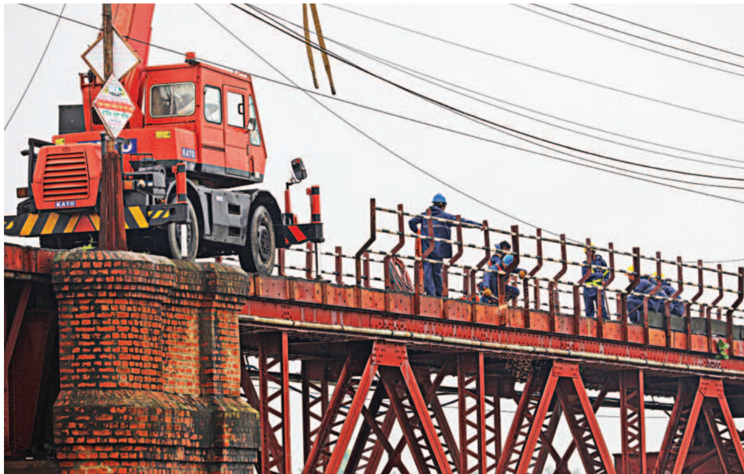
Workers renovating the Kalurghat bridge over the Karnaphuli in Chattogram. Traffic on the bridge has been suspended for the work. The rail bridge was built in the 1930s and later it was turned into a rail-slash-road bridge. This bridge is key to the Dhaka-Cox's Bazar rail service schedule to start this year.