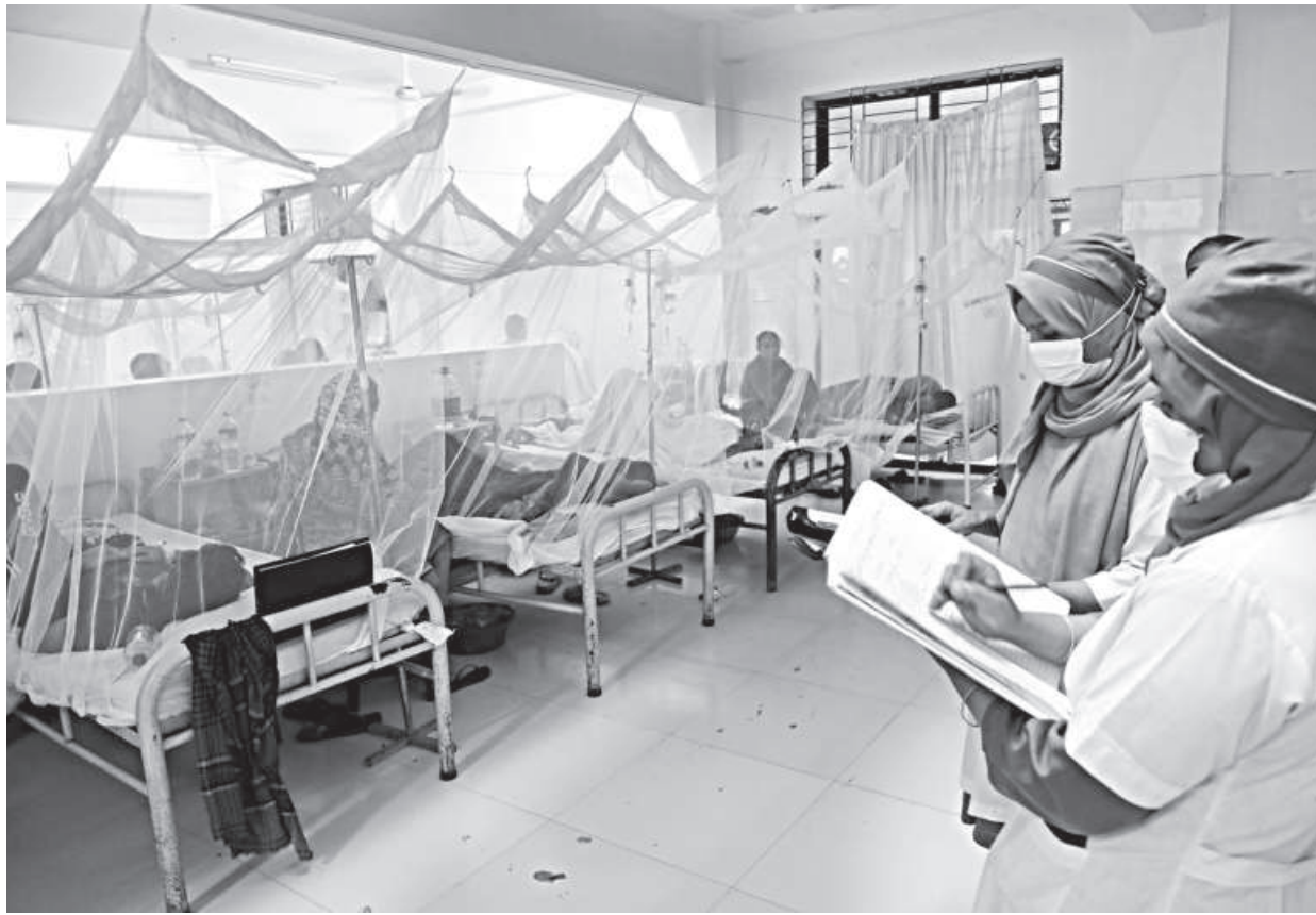
Given our recent Covid-19 pandemic experience, why have the authorities not done anything to enhance the capacity of our healthcare system?