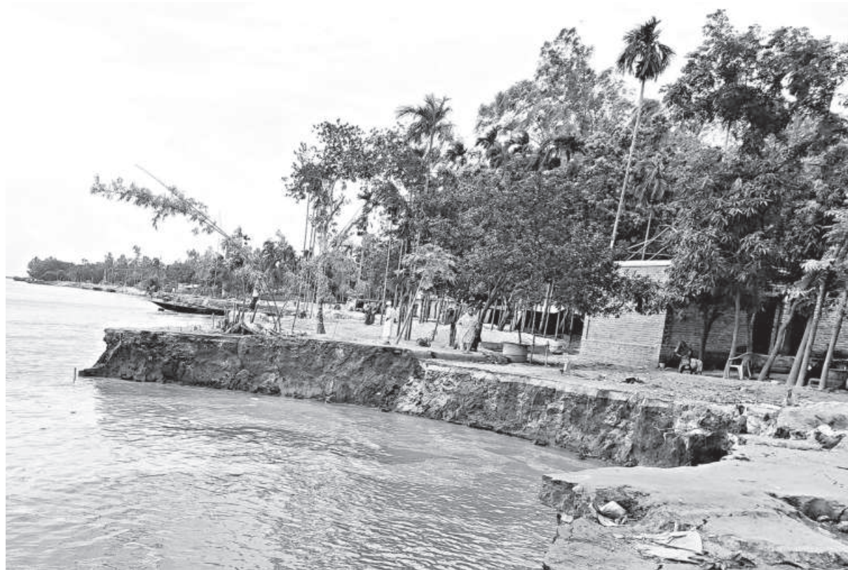
Hundreds in Tangail's Bhuapur, Kalihati, Nagarpur and Sadar upazilas lose their homesteads and arable lands to erosion as the Jamuna swells.