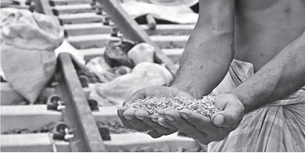
A farmer tries to dry whatever paddy seeds he could salvage after the recent flood in Chattogram inundated his land. Like him, hundreds in three districts of the division are facing the same predicament. The photo was taken recently.