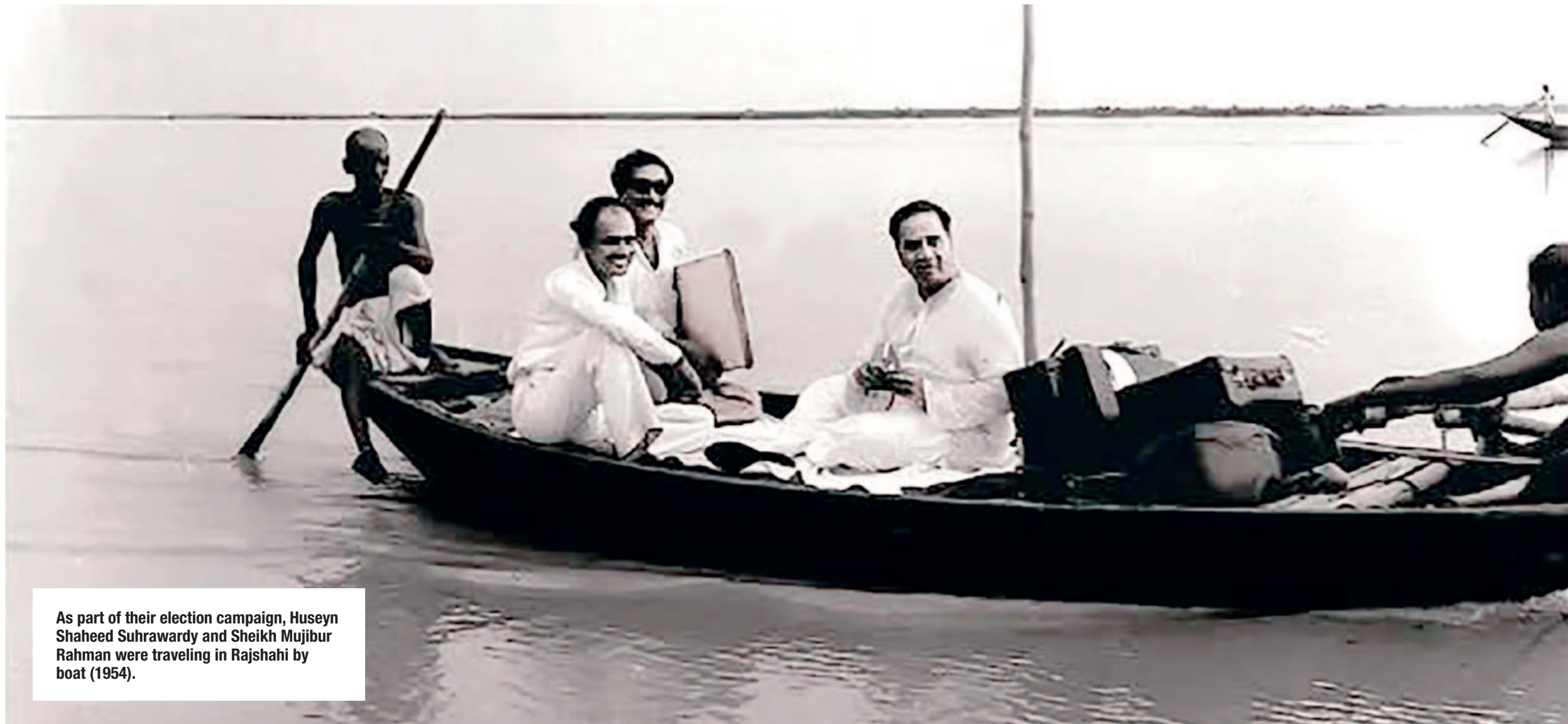
As part of their election campaign, Huseyn Shaheed Suhrawardy and Sheikh Mujibur Rahman were traveling in Rajshahi by boat (1954).