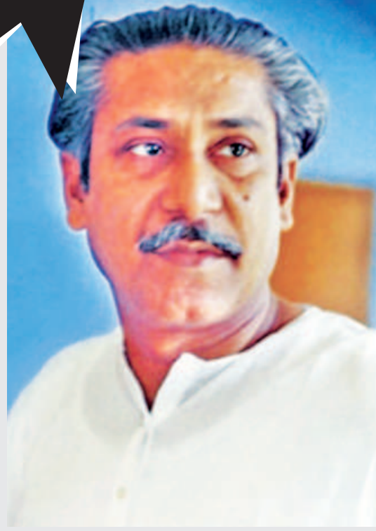
Bangabandhu Sheikh Mujibur Rahman