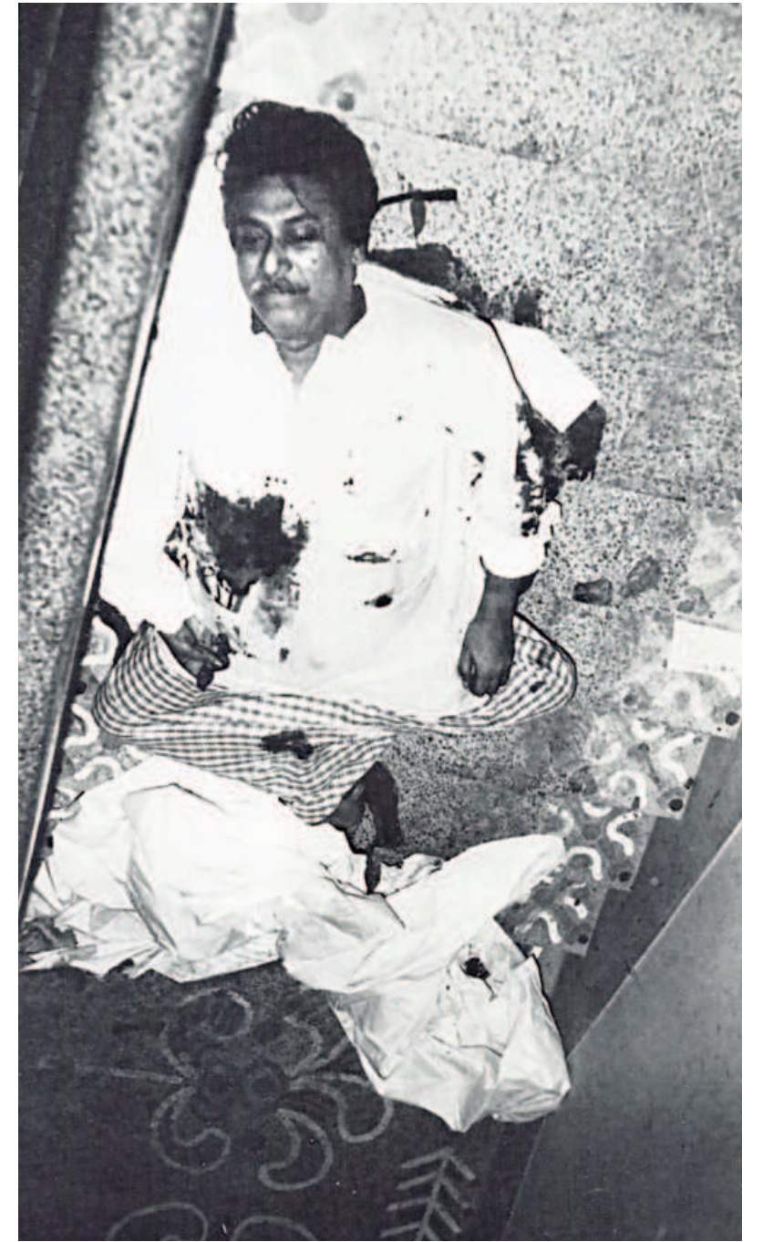
Bangabandhu's lifeless body lies on the stairs of his residence in Dhanmondi 32.