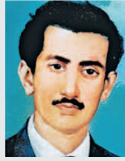
Sheikh Fazlul Haque Moni