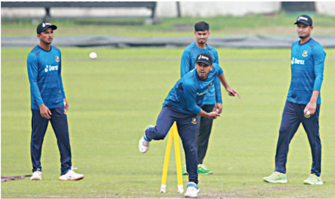
Bangladesh off-spinner Mehedi Hasan Miraz gives it a rip in training at the Sher-e-Bangla National Cricket Stadium yesterday as other members of the spin unit, Sheikh Mahedi, Nasum Ahmed, and Taijul Islam wait for their turn.

"We have worked so hard to get here ... I want the whole team to enjoy it and for the whole of Spain to be behind us."