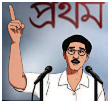
Animated film Mujib Bhai

play Obhishopto August at 12:40 pm. The feature film Tungiparar Miya Bhai , directed by Shamim Ahamed Roni, will be aired at 2:30 pm. Poem recitation for Bangabandhu will be shown at 6:20 pm, while the read-along of excerpts from Bangabandhu'r Oshomapto Atmajiboni will be aired at 6:45 pm. The talk show Tarunner Bhabnay Bangabandhu will be featured at 7 pm. Special fiction Abar Ashibo Phire , directed by Animesh Aich will be telecasted at 9 pm.