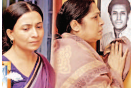
Rintur Na Phera