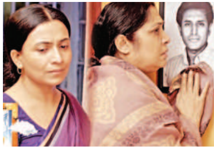
Rintur Na Phera