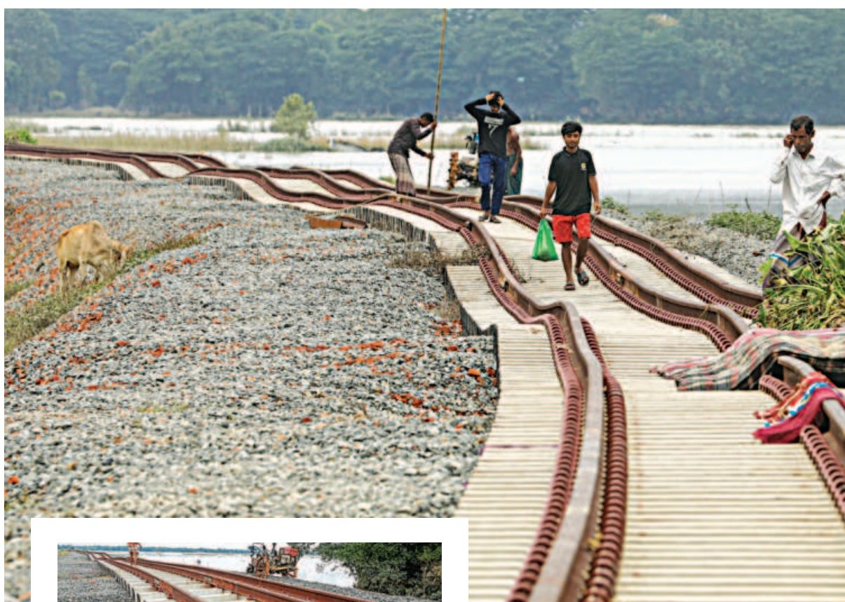
Even before its inauguration, the Chattogram-Cox's Bazar rail line has been badly damaged by floods in Keuchia of Chattogram's Satkania upazila. A vast swath of the upzila went under water last week. The photos were taken on Sunday.