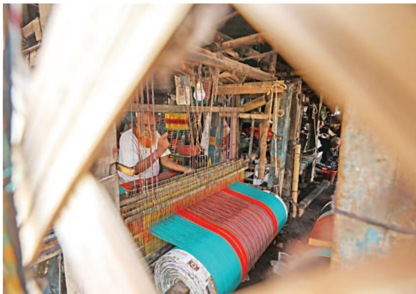
One of the handful of people who refuse to give up their traditional yet dying skill in operating handlooms. Though power looms have mostly taken over with their ability to produce fabric at a faster and cheaper rate, handloom fabrics are often softer in texture and more resilient. The photo was taken from Chattogram city's Panchlaih area recently.