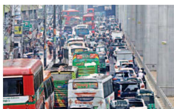
Rain inundated multiple streets in the capital. While water receded in some of the many submerged lanes and alleys around the city rather quickly, dwellers of Mirpur, Shantinagar, Badda, and Old Dhaka had to spend long hours stuck in traffic as the areas remained waterlogged. The photos were taken yesterday from Farmgate and Dhaka University areas.