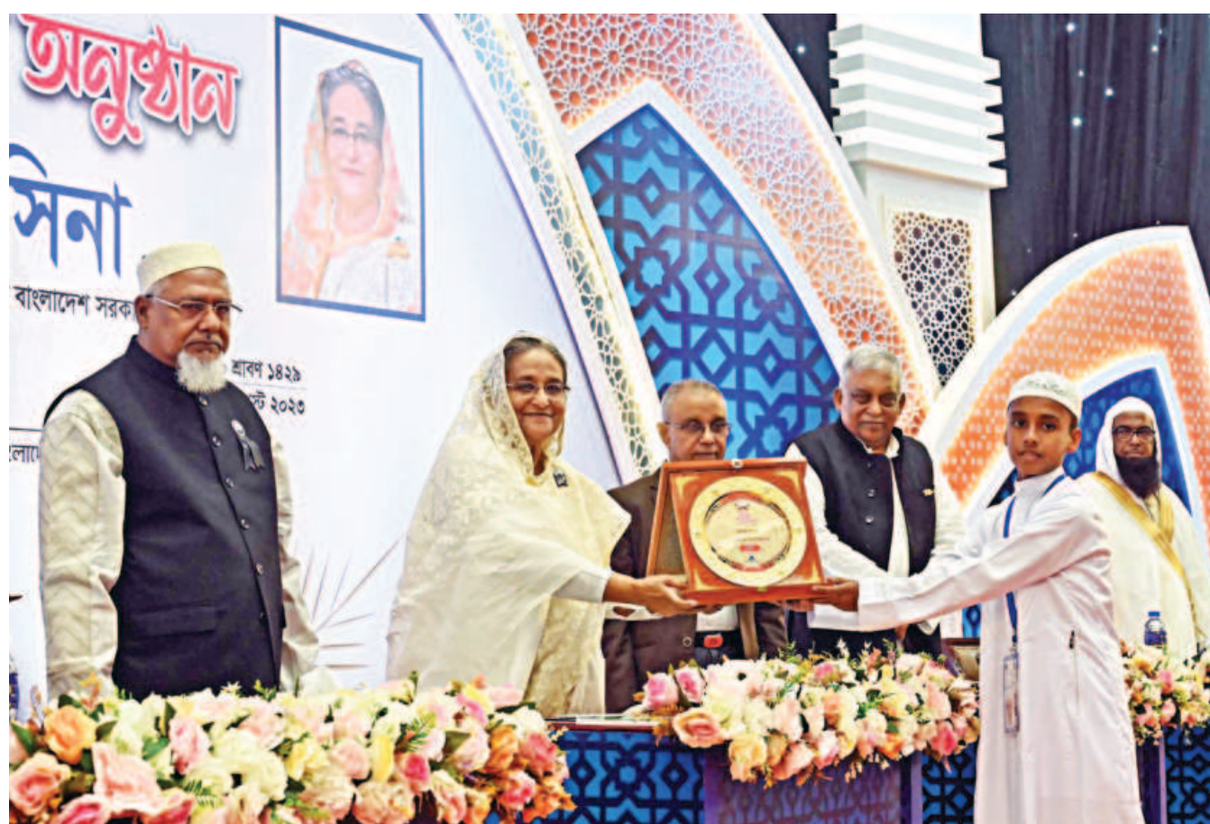
Prime Minister Sheikh Hasina hands over an award to a winner of the National Hifzul Quran competition 2023 held at Bangabandhu International Conference Center yesterday.

The deputy commissioners and officers-in-charge have also been asked to take initiatives to make the drive effective.