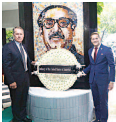
Visiting US congressmen place a wreath at the mural of Bangabandhu on Dhanmondi-32.