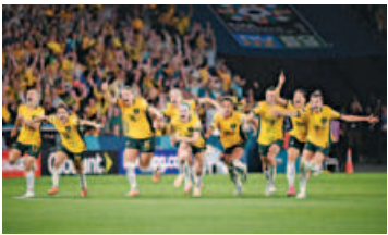
England's Alessia Russo celebrates with teammates after scoring the winning goal in a 2-1 victory over Colombia during their FIFA Women's World Cup quarterfinal fixture in Sydney yesterday. The Lionesses will play their semifinal against cohosts Australia (Inset), who beat France in penalty shootout in the other quarterfinal of the day in Brisbane.