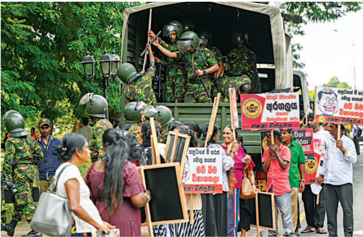
Special Task Force (STF) soldiers get off a vehicle as People's Revolution party activists hold placards during a demonstration in Colombo, Sri Lanka yesterday, to demand greater democratic freedoms as the government has moved to crackdown on large protests over economic hardships as the country emerges from its worst economic crisis.

In a letter written to Shehbaz and Riaz yesterday, the president recalled that he had dissolved the NA on the former's advice on Aug 9.