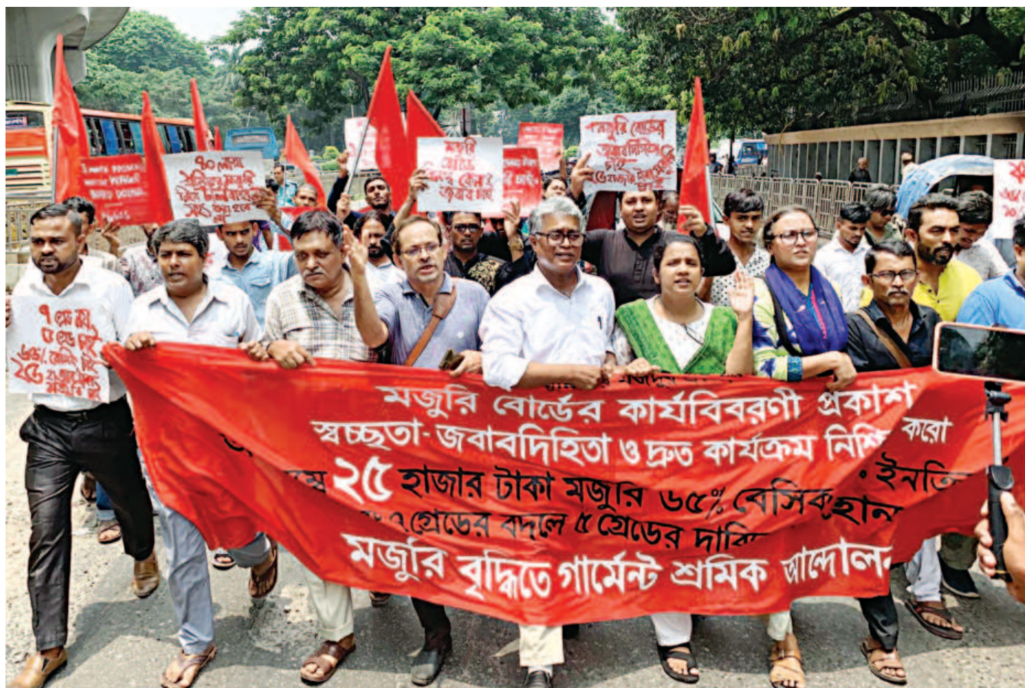
Demanding Tk 25,000 as minimum wage for readymade garment workers, leaders of 11 rights organisations held a procession in the capital’s Jatiya Press Club area yesterday.