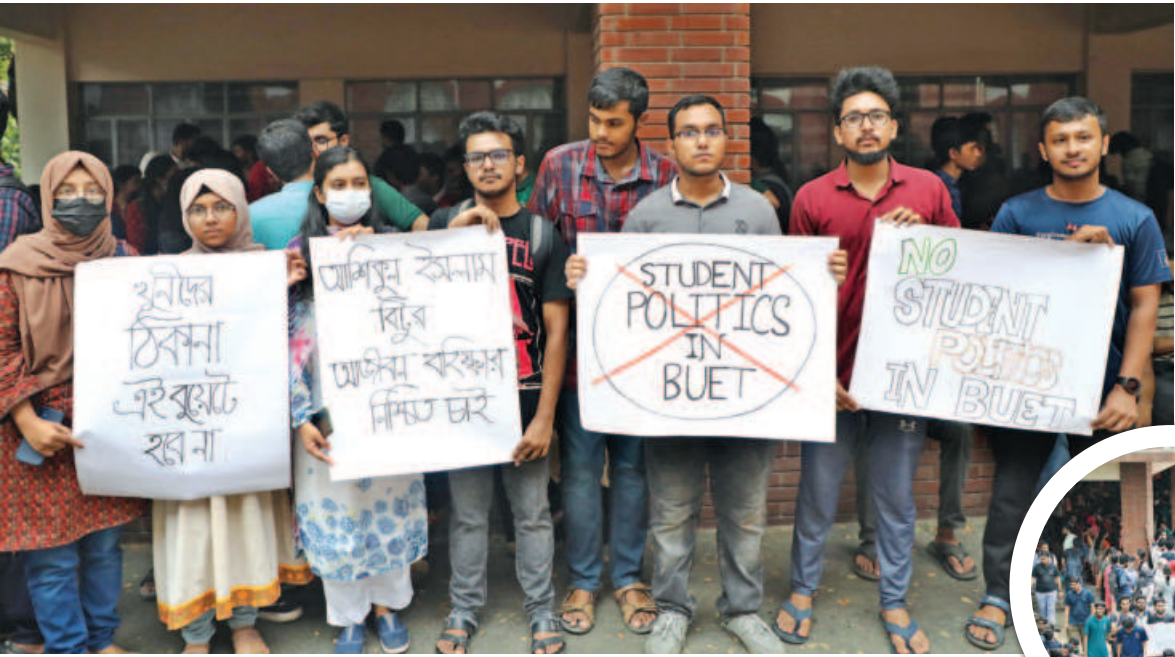
Buet students boycott classes and stage a sit-in on the campus yesterday, protesting the return of a student expelled earlier by the authority in connection with the Abrar Fahad murder case.