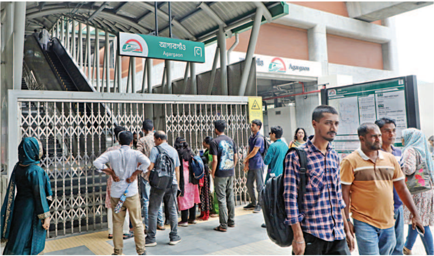
Metro rail services remained suspended for about two hours yesterday, starting at 9:31am. This was the second time the services were halted due to a technical problems on the tracks, with the problem this time being a glitch in the overhead electric lines. The services resumed around 11:45am. The photo was taken from the Agargaon metro station.

Prime Minister Sheikh Hasina yesterday declared another 12 districts and 123 upazilas free of homeless and landless people as 22,101 more families were provided with homes under the Ashrayan-2 project. She made the announcement and opened the distribution of the houses to the homeless and landless families through a videoconference from the Gono Bhaban. With the 12 districts and 123 upazilas, a total of 21 districts and 334 upazilas throughout the country have so far become homeless and landless family-free. The premier was connected virtually with the beneficiaries and people of three places while distributing the houses. The places are Barasat Sonar Bangla Palli Ashrayan Project site in Terokhada upazila under Khulna, Chakla Ashrayan-2 project site in Bera upazila under Pabna, and Amanullahpur Ashrayan project site in Begumganj upazila under Noakhali district. The 12 districts are Manikganj, Rajbari, Mymensingh, Sherpur, Dinajpur, Naogaon, Natore, Pabna, Kushtia, Pirojpur and Jhalakathi. Earlier, nine more districts earned similar distinction.