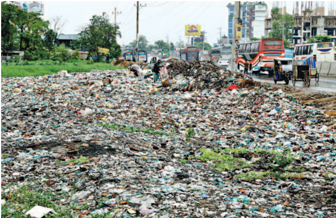
What looks like a dump yard is actually a part of DND canal next to the Dhaka-Chattogram highway. Piles of non-biodegradable garbage dumped by locals have completely choked the waterbody. Though there is a dedicated DSCC dumping zone within a kilometre, this mindless action continues. The photo was taken in the capital's Jatrabari area yesterday.

STAFF CORRESPONDENT BNP Secretary General Mirza Fakhrul Islam Alamgir yesterday said the government's move to introduce Cyber Security Act through changing the name of Digital Security Act is tantamount to "deceiving people". "BNP firmly believes that the Awami League government is trying to deceive the people by merely changing name SEE PAGE 4 COL 6