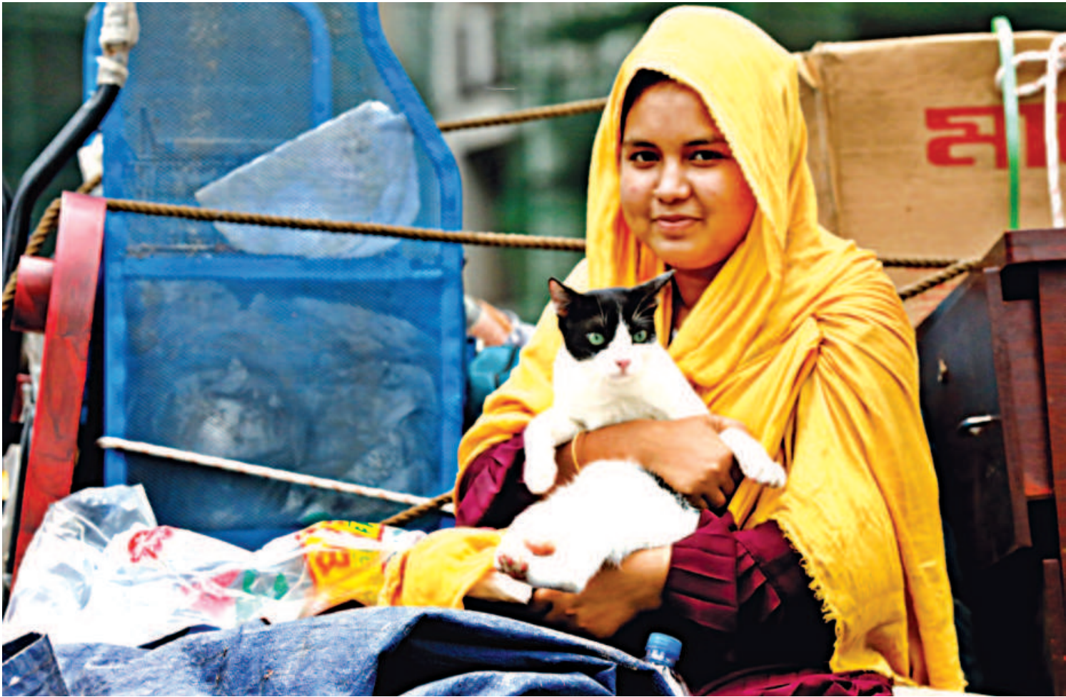
DRIVING HOME... Amid furniture, kitchen racks and cupboards, a woman tries to ensure that her cat is comfortable and safe as the pick-up truck carrying them to their new home hits the Kemal Ataturk Avenue. This photo was taken on International Cat Day, celebrated around the world yesterday.