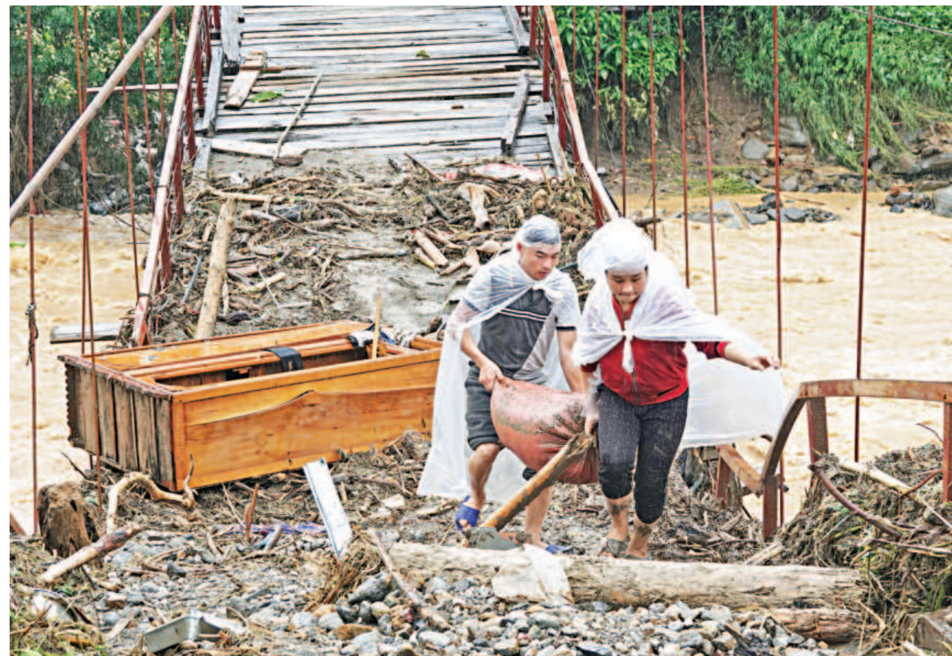
Residents carry belongings after heavy rains caused flooding and landslides in Mu Cang Chai district, Yen Bai province, Vietnam yesterday. Flash floods and landslides have killed at least eight people across northern Vietnam, disaster officials said.