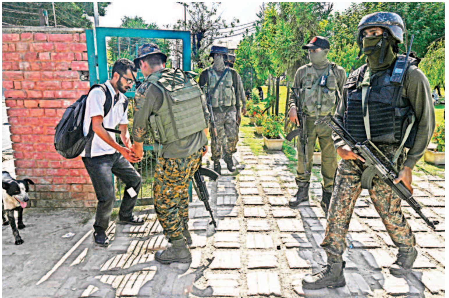
Indian paramilitary troopers carry out a precautionary search operation at a park in Srinagar, Jammu and Kashmir yesterday, ahead of the country's 77th Independence Day.

Ever since his ouster, Khan has been campaigning for a snap election and organising protests, which led to significant violence on May 9.