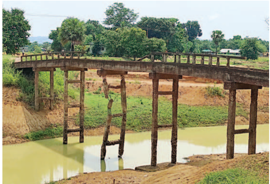
This old bridge at Promod Karbari Para in Rangamati's Baghaichhari upazila has remained in a vulnerable condition, posing threat to a fatal accident.