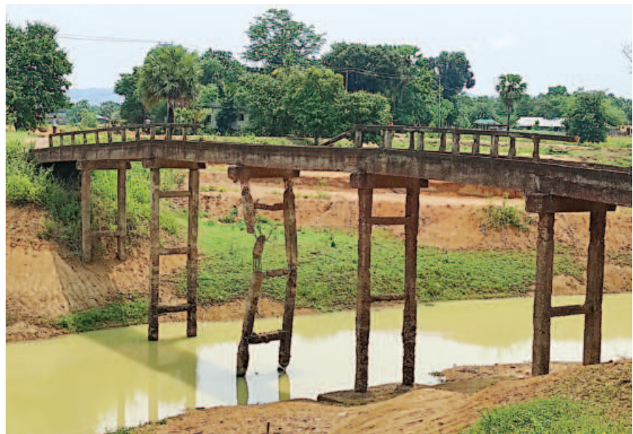
This old bridge at Promod Karbari Para in Rangamati's Baghaichhari upazila has remained in a vulnerable condition, posing threat to a fatal accident.