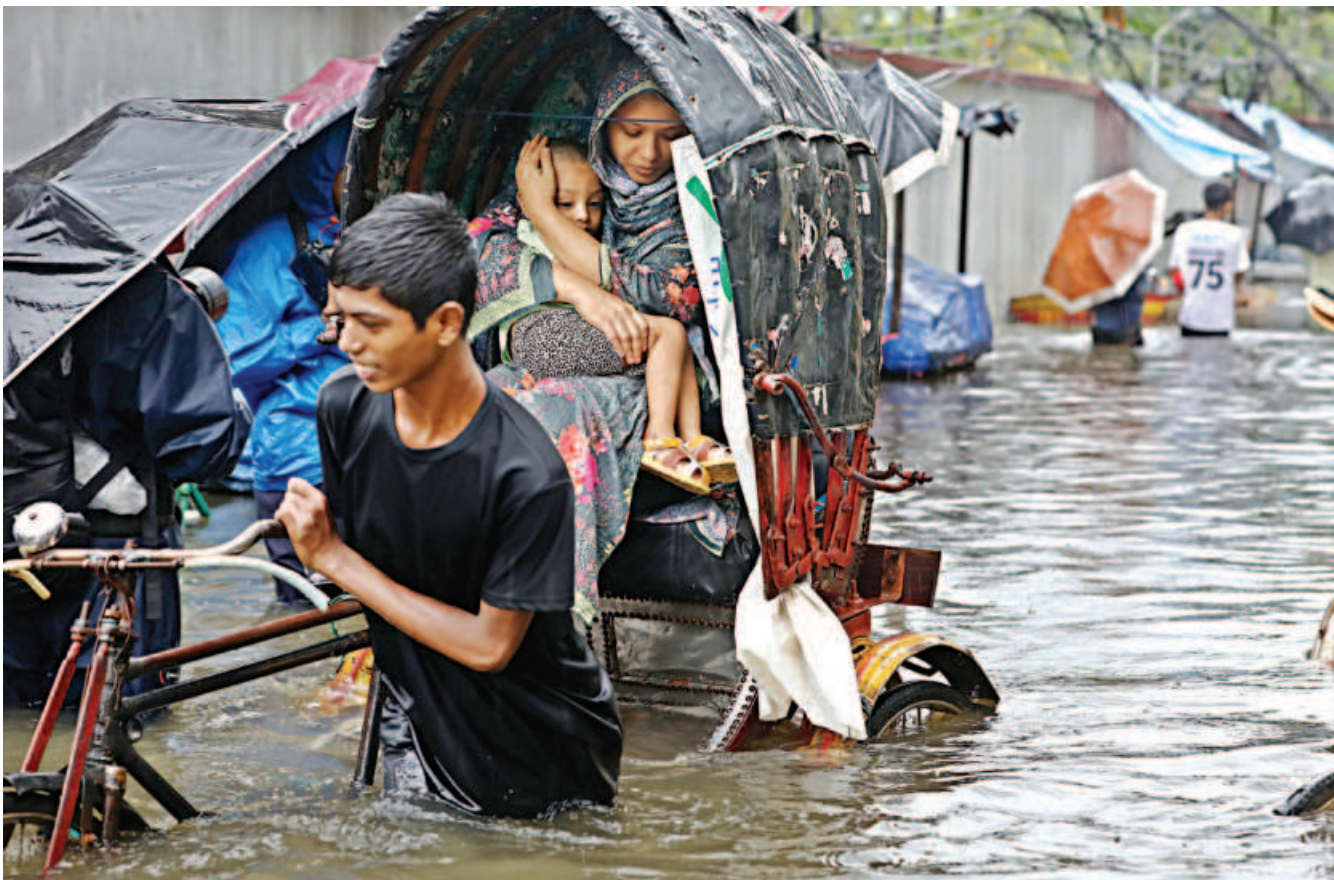
A mother holds on to her child tight as a rickshaw-puller tries to navigate through almost waist-deep water on a street in Shantibagh Abashik in Agrabad area of Chattogram city yesterday. Parts of the city have been under water for three straight days.

Wheat, raw sugar, soybean oil, SEE PAGE 7 COL 1