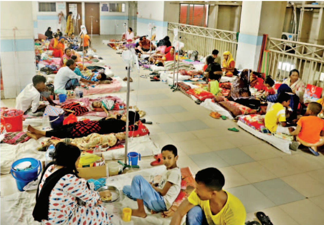
Dengue patients on the floor in front of doctors' chambers at Mugda Medical College Hospital yesterday. A part of the floor gets wet when it rains but patients ignore that for medical treatment at the hospital.