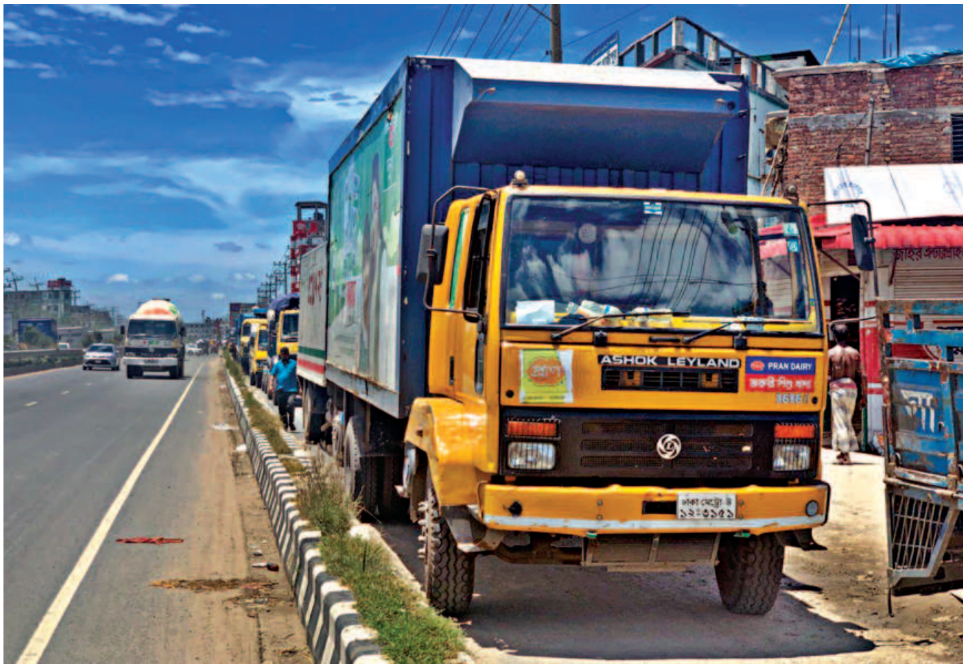
Trucks park in the service lane of Gazipur-Tangail highway clogging the lane emergency vehicles often have to use when crashes or breakdowns block the highway. The photo was taken in Gazipur's Bhogra area recently.