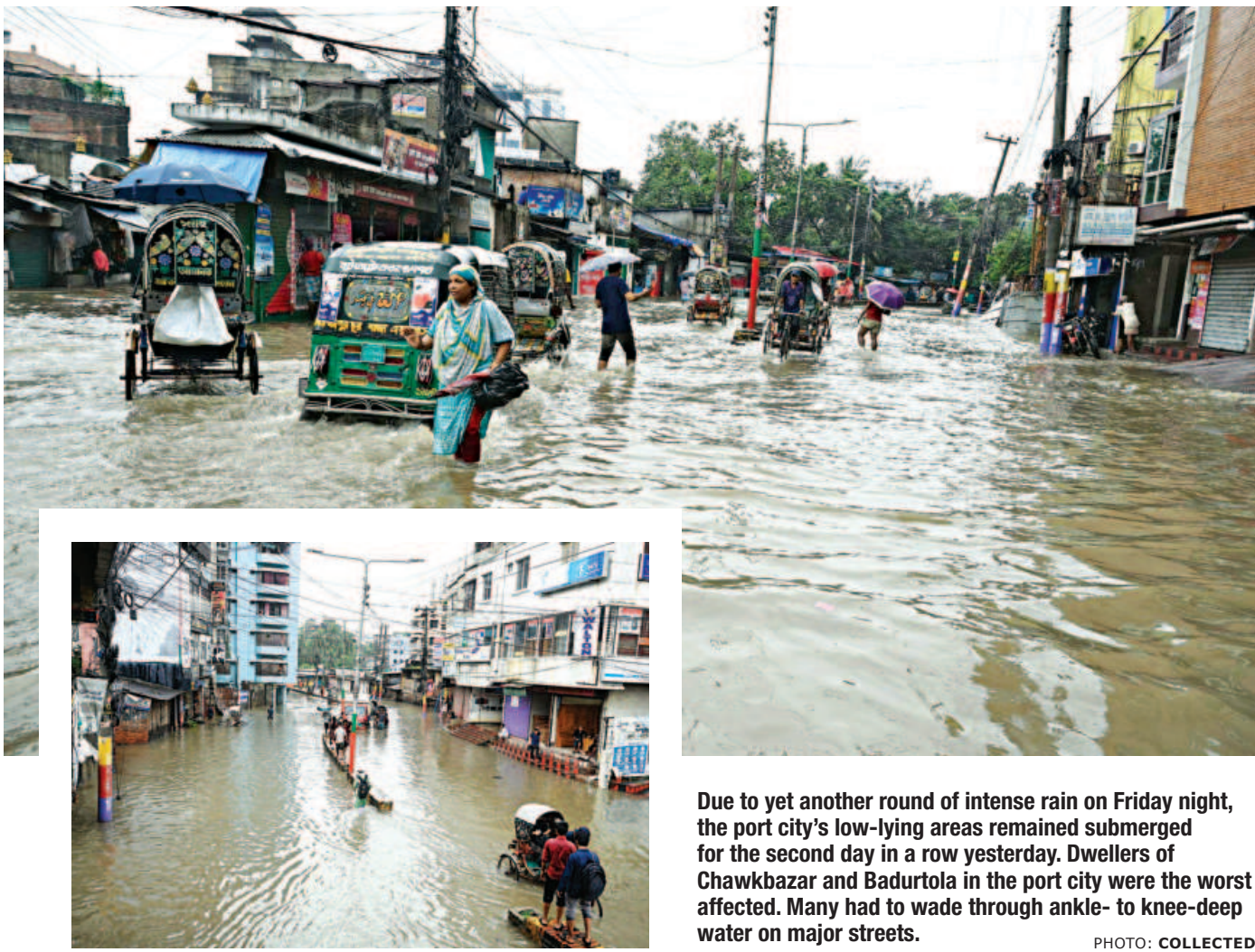
Due to yet another round of intense rain on Friday night, the port city's low-lying areas remained submerged for the second day in a row yesterday. Dwellers of Chawkbazar and Badurtola in the port city were the worst affected. Many had to wade through ankle- to knee-deep water on major streets.