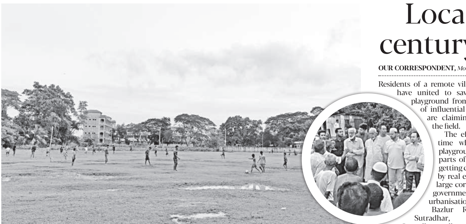
Children and youths engaged in a game of football at their beloved playground, amid the uncertainty surrounding its ownership. Three influential persons have claimed the field, although locals say the playground is under the jurisdiction of village panchayat. Inset, The villagers and representatives from Bapa have joined hands to save the playground. The photos were taken from Rampur village in Habiganj recently.