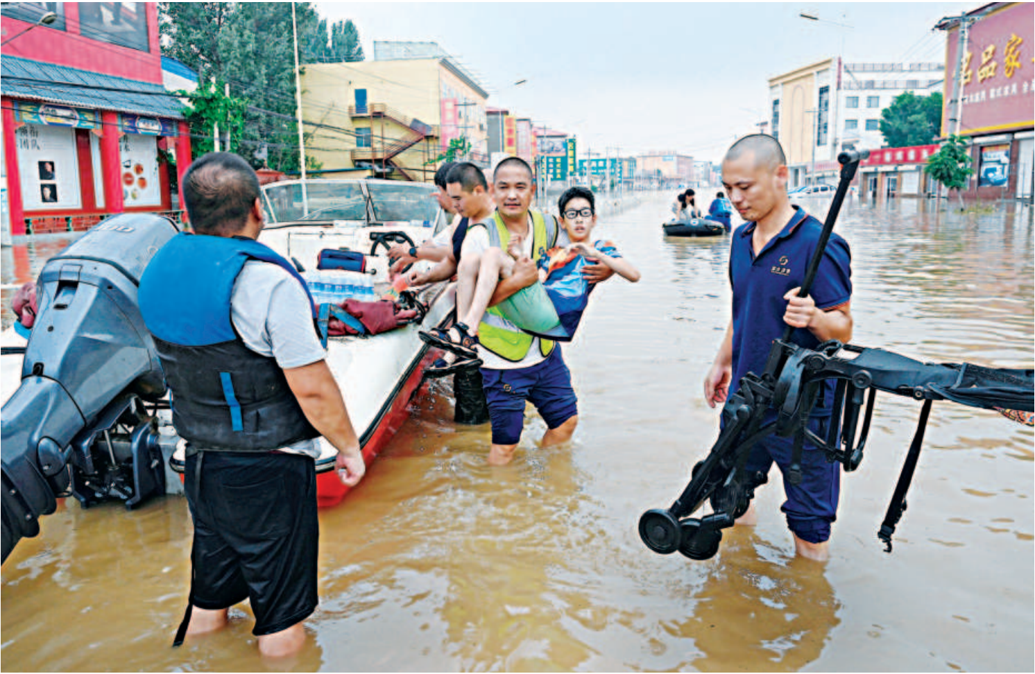
Rescue team personnel evacuate residents from a flooded area following heavy rains in Zhuozhou, in northern China's Hebei province yesterday. Deadly rains that pummelled China's capital in recent days were the heaviest since records began 140 years ago, Beijing's weather service said yesterday, as a massive cleanup operation began.

India last month hosted a summit of the Shanghai Cooperation Organisation in a virtual format.